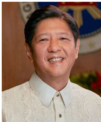
▶ PBBM ADMIN • 5 President Bongbong Marcos

"But we have in fact, actually accelerated it further and have made it a priority because we understand the importance of the infrastructure development, not only in terms