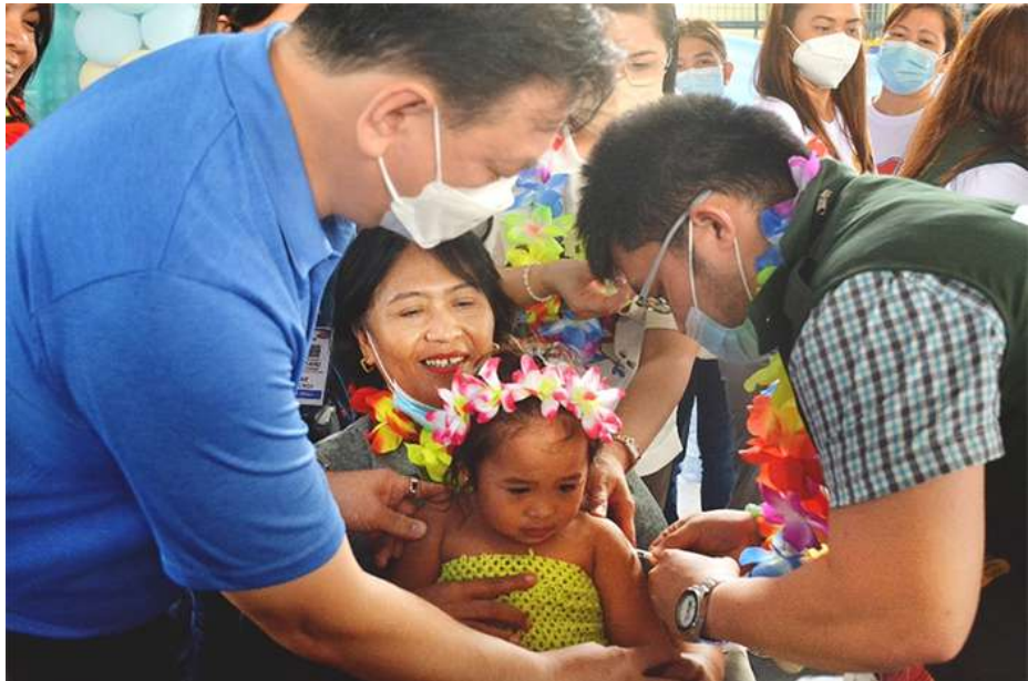
Bacoor City Mayor Strike B. Revilla