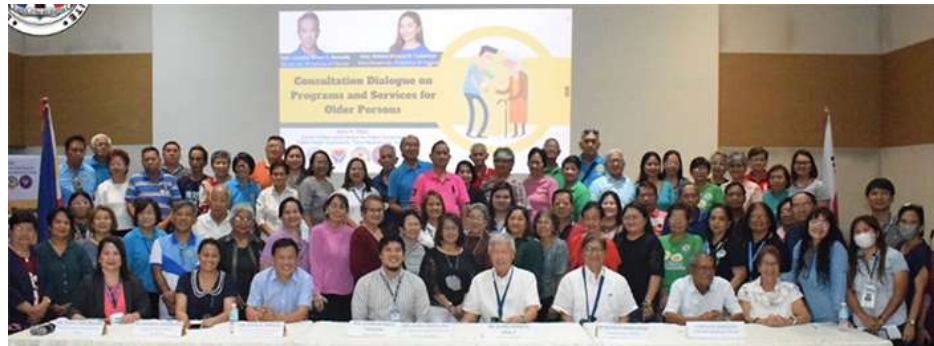
APAT SA BAYAN. TAPAT SA USAPAN. PSWDO - CONSULTATION DIALOGUE ON PROGRAMS AND SERVICES FOR OLDER PERSONS APRIL 14, 2023 | CCCPH, TRECE MARTIRES CITY

TRECE MARTIRES CITY, Cavite — The provincial government of Cavite is recalibrating its programs and services for senior citizens as it continues to improve the welfare and development of the country's elderly sector.