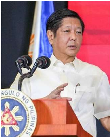
President Bongbong Marcos