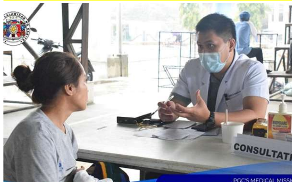
APAT SA BAYAN. TAPAT SA USAPAN. PGC'S MEDICAL MISSION APRIL 13, 2023 | MENDEZ, CAVITE

TRECE MARTIRES CITY, Cavite — More than 400 residents from Mendez town and Dasmariñas City availed themselves of free healthcare services in a medical mission organized by the provincial government of Cavite from April 14 to 15.