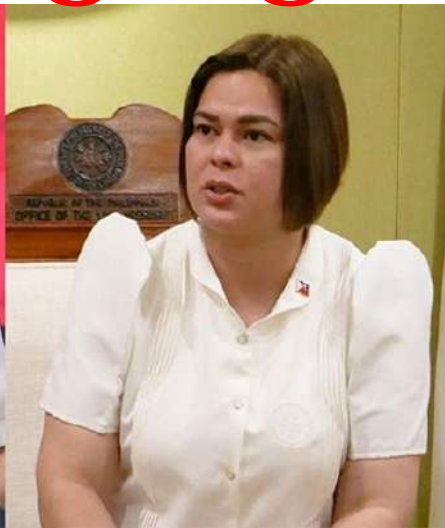
Vice-President Sara Duterte