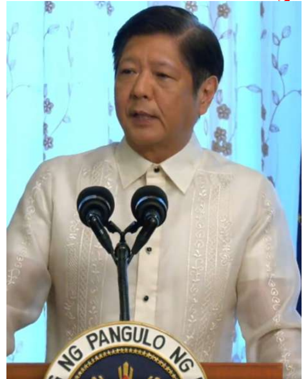
President Bongbong Marcos