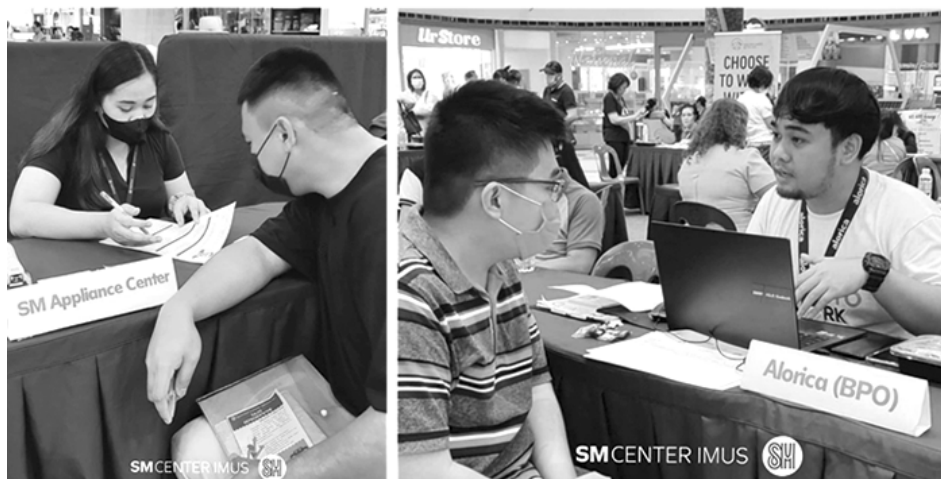
CAVITE- SM Center Imus, in partnership with PESO and the City Government, recently held a one-day Job Matching Event at SM Center Imus Event Center. The event was attended by job seekers who are looking for the best opportunities matching their credentials and potentials. The job matching event was successful with the help of the participating companies such as Alorica, AIA Philippines, Pro-Tempo Promotions & Marketing Corporation, Vilmar Manpower Agency, Home Credit, Jac Liner, Euro-Med Laboratory, South Meats, Generation One Resources Recruitment, Waltermart, Oneimus Job Contracting Services, Emi-Yazak, S&R Imus, Our Lady of the Pillar Medical Center, Maxicare, The Binondo Food Group, Optimized Customer Solutions, Inc., SM Appliance Center, Shopping Center Management Corporation, Ace Hardware, Elite Jinzai, and People Serve.