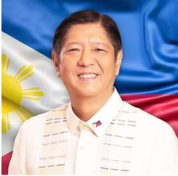
President Bongbong Marcos

Negroponte said the Philippine leader's visit to Washington last Monday laid the framework for the commitment of the group to support Manila. "(The) President's visit... sets the table for our work, of US-Philippine Society in the months and years ahead, thank you for that," Negroponte told