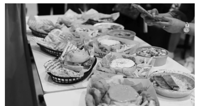
Some of the Cheesy products of EBC were showcased during the event

For more information, you may visit EBC's social media pages: Facebook, Instagram, Tiktok, and YouTube @everythingbutcheese. You can also send your email to marketing@everythingbutcheese.com .