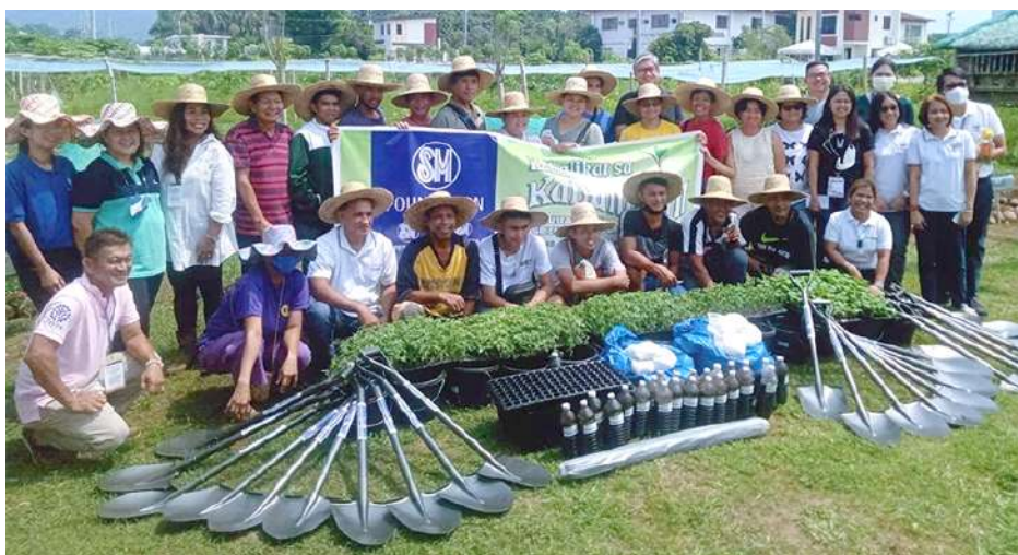
KSK-SAP farmers and partners from San Pablo City, Laguna.

The local farmer-beneficiaries will undergo a two-► LOCAL FARMERS • 5