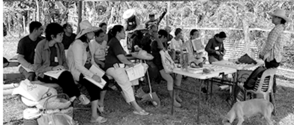
KSK Trainees at Tabangao Ambulong, Batangas City, Batangas

would uplift the farming skills, food security, and livelihood know-how of low-income Filipino farmers. Over the years, the program has evolved into a comprehensive training program that generates opportunities for skills development, employment, and