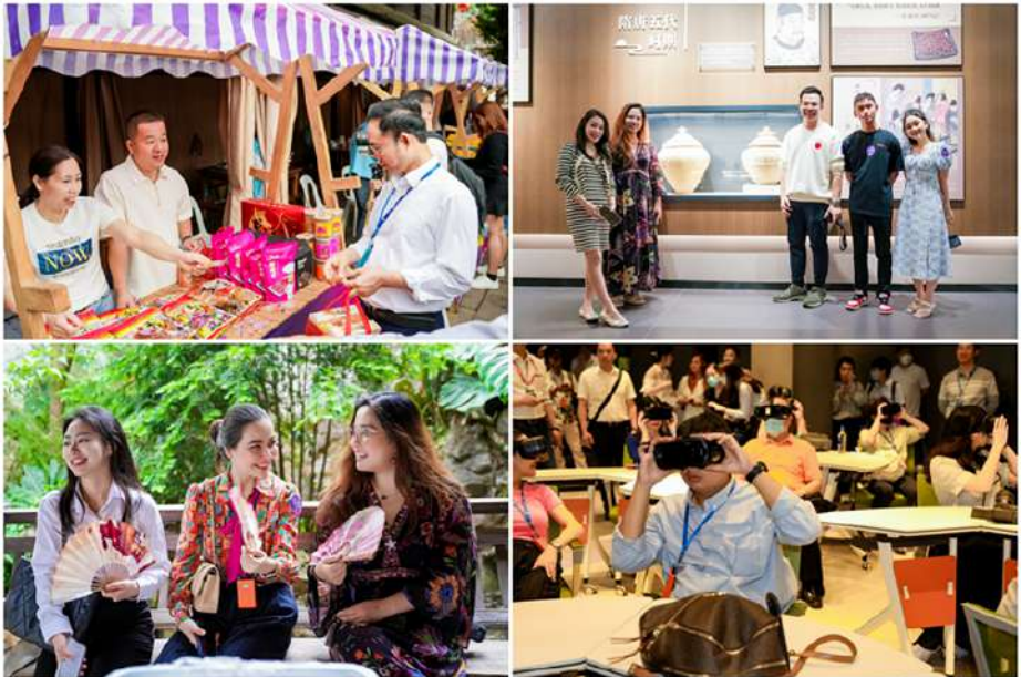
The Second ASEAN-China Online Influencers Conference themed "Meet in the Blessed Land across Mountains and Seas" concluded successfully in Fuzhou, China on May 21.

The event was joined by over 60 guests, including diplomatic envoys, 13 online influencers, and media representatives from China and the ten ASEAN countries, who discussed China-ASEAN development achievements, economy and trade, digital economy, and other topics. The conference was livestreamed and watched by over 14 million people. ► SECOND CHINA • 6