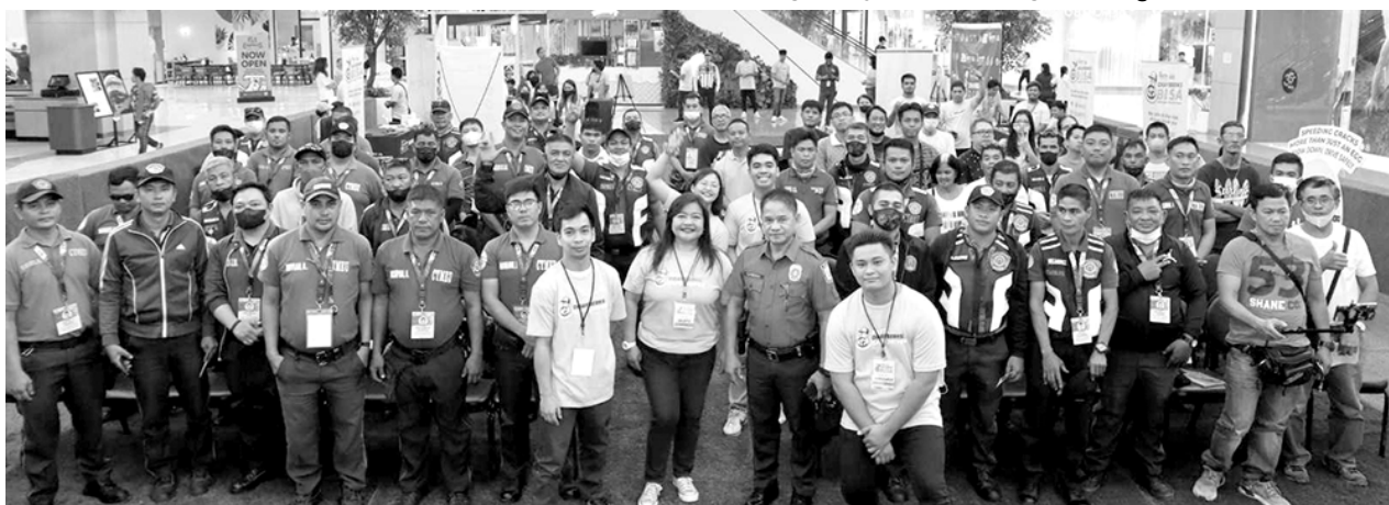
MPT South and the City Government of Santa Rosa work hand in hand in creating a safer environment for the community of Santa Rosa, Laguna.

Ang mga inisyatibong ito ay nakahanay sa adopted resolution ng United Nations General Assembly na 'Improving Global Road Safety,' na may layung mabawasan ang road traffic deaths at injuries ng 50% bago sumapit ang taong 2030.