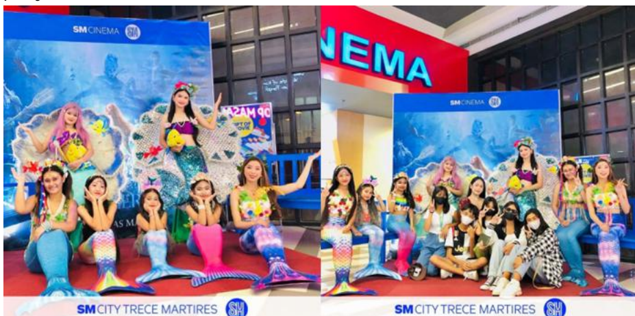
EXPERIENCE THE BEAUTY UNDER THE SEA WITH THE LITTLE MERMAIDS AT SM CITY TRECE MARTIRES - The long wait is over! The Little Mermaid is now at SM Cinema. Ariel and her sisters were PART OF OUR WORLD as they visited SM City Trece Martires! Come and join the fun! Watch The Little Mermaid at SM Cinema today!

From the battles in the old city of New York and the jungle in Peru, to the farthest corners of the universe, Transformers: Rise of the Beast makes it to the Gala Premier at SM Cinema IMAX at SM Megamall and SM City Cebu. Celebrities and other personalities joined the force as SM Cinema presented the exclusive watch party of the live action film.