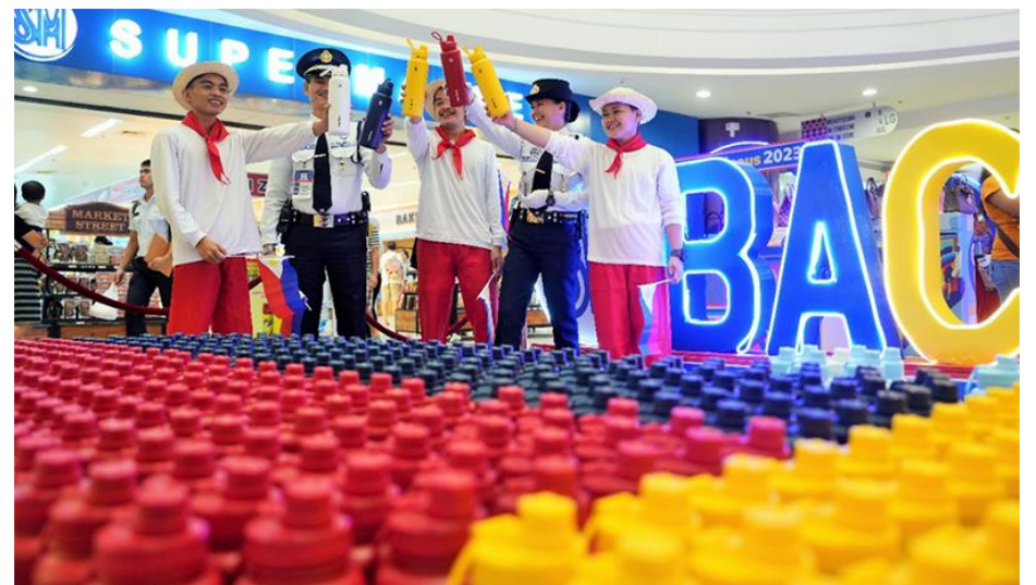
In the photo: SM City Bacor Janitorial staff proudly dressed as Katipuneros making a toast with mall guards to celebrate the 125th Anniversary of the Philippine Independence.

SM CITY BACOR, CAVITE - Lift your spirits high as we celebrate the Philippines' 125th Independence Day Anniversary at SM City Bacor Event Center with a colorful street full of Super Pinoy brands and locally made products, and a huge installation art assembled from hundreds of AquaFlask bottles in the colors of the Philippine Flag. This artwork resembles an image of a Super Pinoy Tumbler, a unique reminder of our heroes' thirst to fight for our nation's freedom from the hands of oppressors, and to establish our own identity as Filipinos.