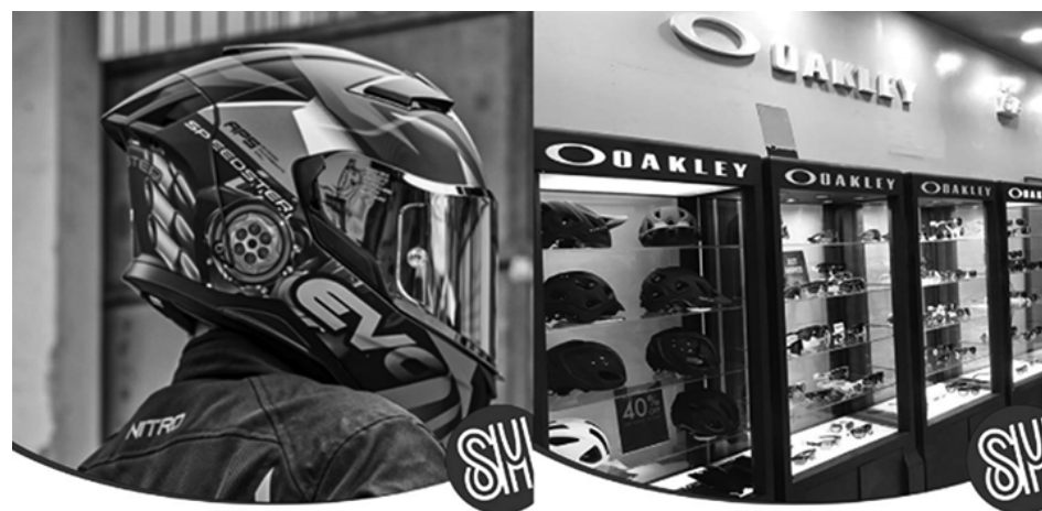
Evo Helmet at Moto