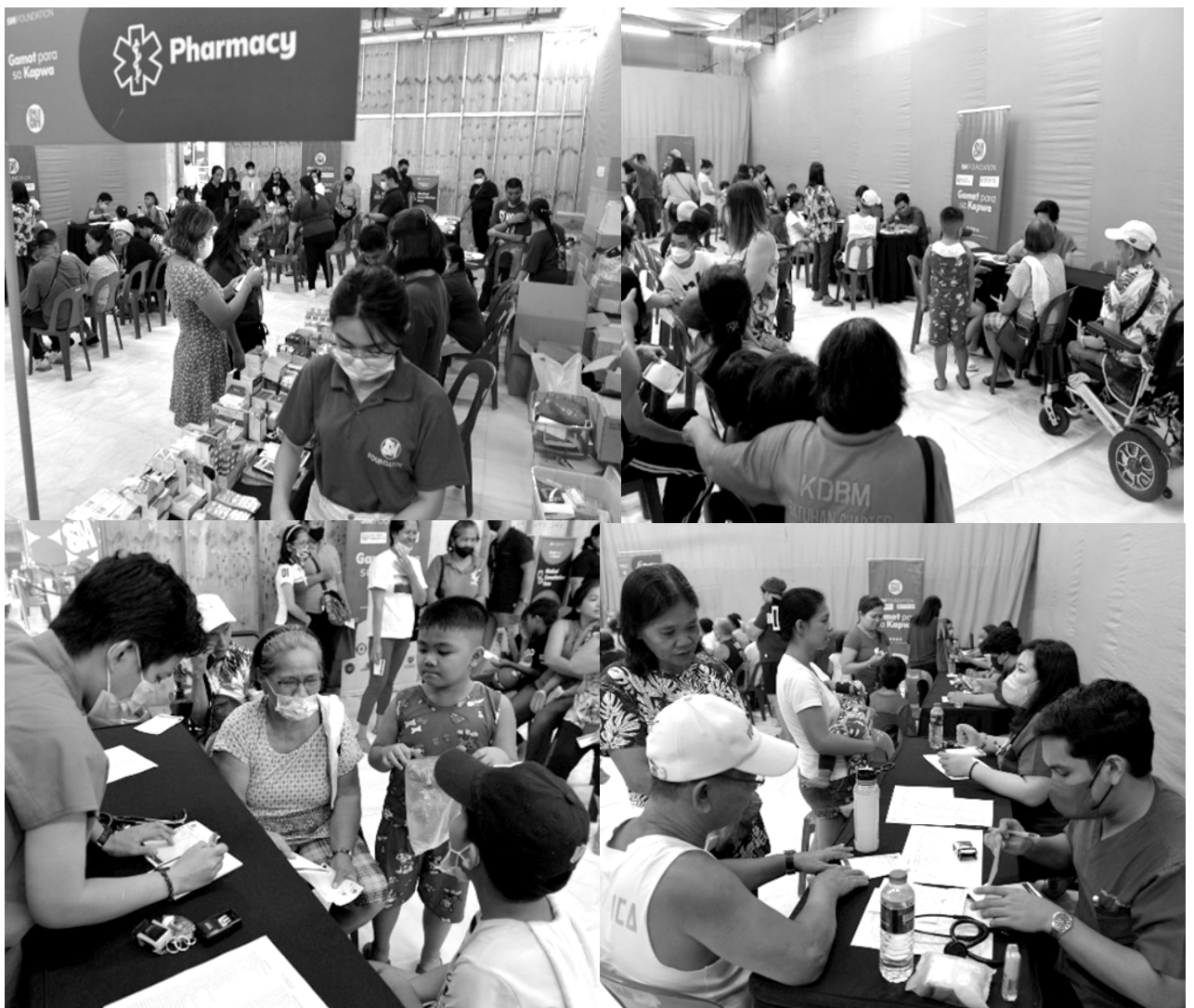
SM Foundation together with SM City Dasmariñas and in partnership with Dalta Jonelta Foundation, Inc. and Philippine Red Cross, conducts Gamot para sa kapwa, a medical mission with various medical services and free medicines. Almost 500 Dasmariñenos benefited from the said event.

NOTE: All news articles and opinions expressed by the writers are entirely their own and do not reflect the opinion of the Publisher, Management of this Publication.