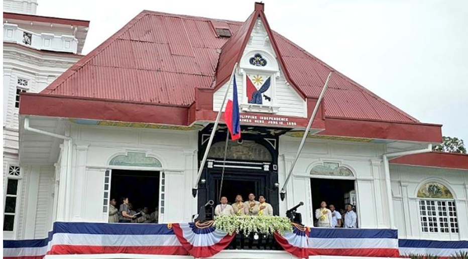
Kawit's 125th Philippine Independence Day celebration Guest-Of-Honor and Speaker Executive Secretary Lucas P. Bersamin (in balcony, extreme left) led Monday's flag raising ceremonies. He is joined by Cavite's local officials.