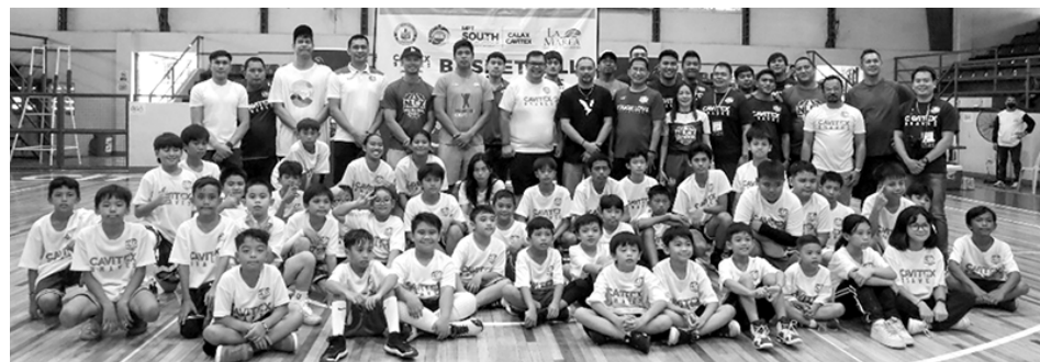
Basketball Clinic-GenTri Sports Complex

Ang MPT South ang concessionaire para sa Cavite-Laguna Expressway (CALAX), Manila-Cavite Expressway (CAVITEX), at ang C5 Link Segment nito. Ang NLEX Corporation at MPT South ay mga subsidiaries ng Metro Pacific Tollway Corporation (MPTC), ang infrastructure at toll road development arm ng Metro Pacific Investments Corporation (MPIC). Bukod sa CALAX, CAVITEX, at C5 Link, hawak rin ng MPTC ang concession para sa NLEX (North Luzon Expressway), NLEX Connector Road, SCTEX (Subic-Clark-Tarlac Expressway), at CCLEX (Cebu-Cordova Link Expressway) sa Cebu.