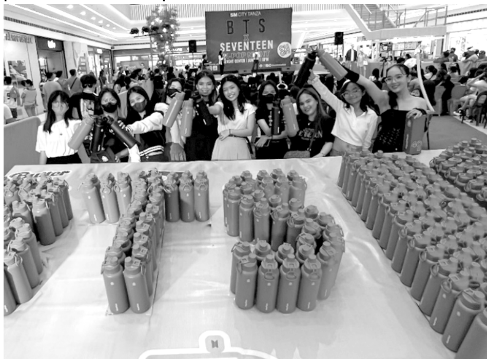
"Cheers for more K-Pop nights at SM Supermalls" –Armys and Carats while holding the AquaFlask Thermal Bottles during a K-Pop night at SM City Tanza.