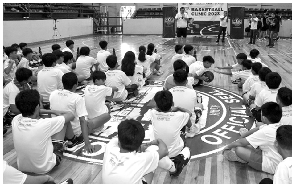
Basketball Clinic BM Morit