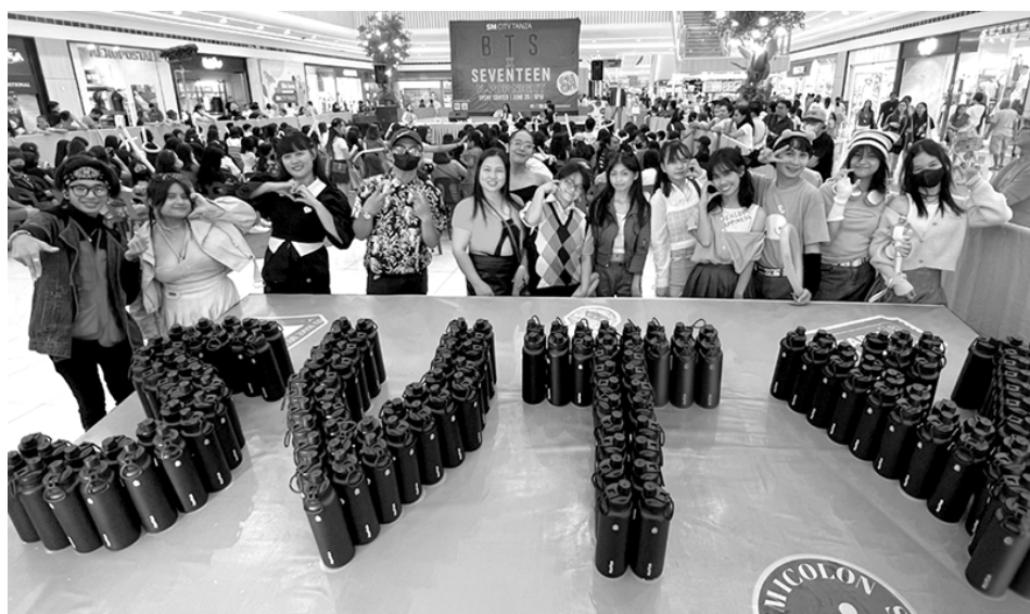
Armys and Carats in their K-Pop outfit posed at the SVT AquaFlask Installation at SM City Tanza during the BTS x SEVENTEEN K-Pop night.

The event was filled with the Armys' 'dynamite' explosion of excitement while the Carats made it so 'Hot Hot Hot'. The Armys and Carats went to the event in costumes and brought K-Pop weapons