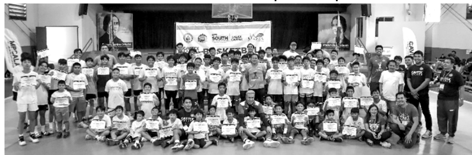
Basketball clinic-La Marea