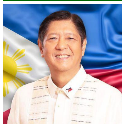
President Bongbong Marcos

High-ranking officials from the executive and legislative branches of government assured the Filipino people on Wednesday of the strengthened socioeconomic platform of the administration of President Ferdinand R. Marcos Jr. aligned with his 8-Point Development Agenda and the Philippine Development Plan.