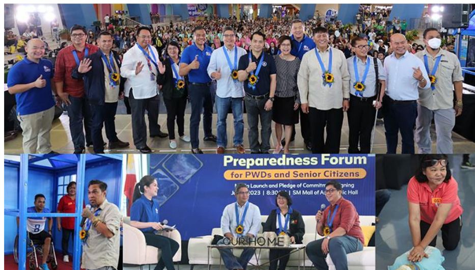
Photo highlights during the Emergency Preparedness Forum on July 5, 2023

In celebration of National Disaster Resilience Month, SM Cares recently launched this year's Emergency Preparedness Forum for senior citizens and persons with disabilities (PWDs). The first of eight forums was held last July 5, Wednesday, at the SM Mall of Asia Music Hall in Pasay City.