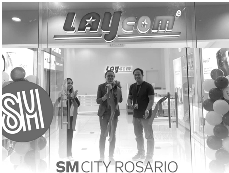
Laycom opens at SM City Rosario - More options for gadgets and accessories await you with the opening of LayCom at SM City Rosario. Visit its store in the cyberzone, 2nd level and grab their promo for selected items.