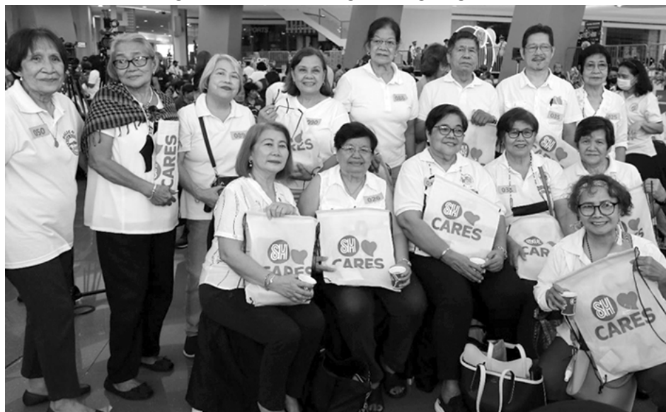
Senior citizen attendees pose for a photo op with their SM Cares emergency go-bags