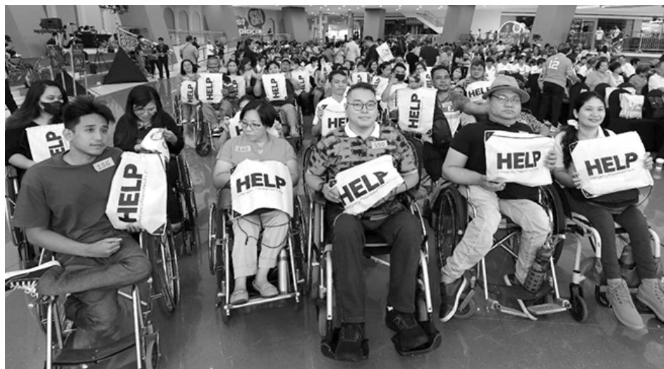
Delegates from Tahanang Walang Hagdan, Inc.