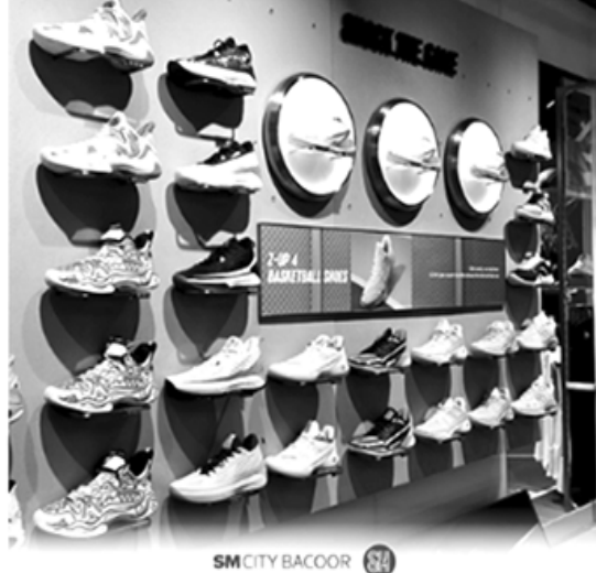
SM CITY BACOOR, CAVITE - NEW STORE ALERT! The long wait for ANTA Store to open is finally over. The first Anta Store to open in Cavite focusing mainly on Basketball is now at SM City Bacoor! Visit Anta Store located at the mall's 3rd Level with your athletic buddies and get that Boujee Kicks & Fits today.

Republic of the Philippines Fourth Judicial Region FAMILY COURT BRANCH 4 Imus City, Cavite fc1imu0004@judiciary.gov.ph Tel. No. (046) 4181948