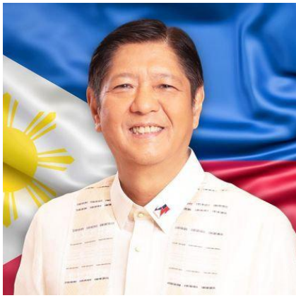
President Bongbong Marcos

"But at the same time iyong 72 na bagon, CKD, ay nakumpleto. The Duterte Administration completed around 55, overhauled 55 light rail vehicles, mga bagon. At iyong 72 within the first six months of the Marcos administration completed, which means general overhauled."