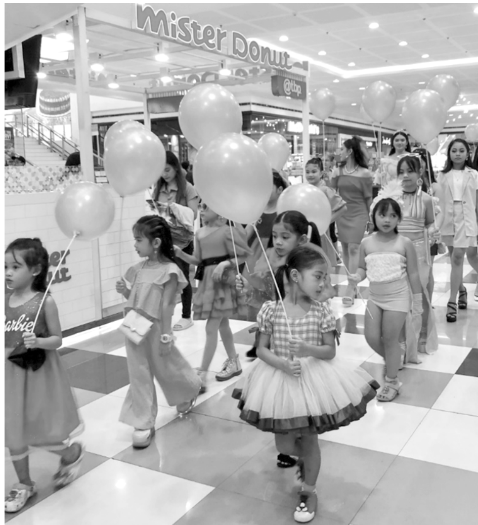
LITTLE BARBIE GIRLS PARADE AT SM CITY TRECE MARTIRES - Wearing their Barbie-inspired outfit of the day, these cute little Barbie girls turned the mall into pink as they paraded in support of the Barbie Movie. Barbie the movie is still showing at SM Cinemas nationwide.

Tunnel boring operation for the subway project started during the Marcos administration.