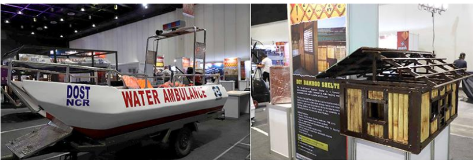
Various R&D projects and technologies were featured in the three-day exposition of Handa Pilipinas 2023 held at the World Trade Center in Pasay City.

The three-day festivity, organized by the Department of Science and Technology (DOST), aimed to serve as a platform to empower communities and barangays through the utilization of available data and research on disaster response, rehabilitation, and recovery. Moreover, it sought to foster collaboration among local government units, private firms, and other groups in embracing innovative Filipino-made technologies.