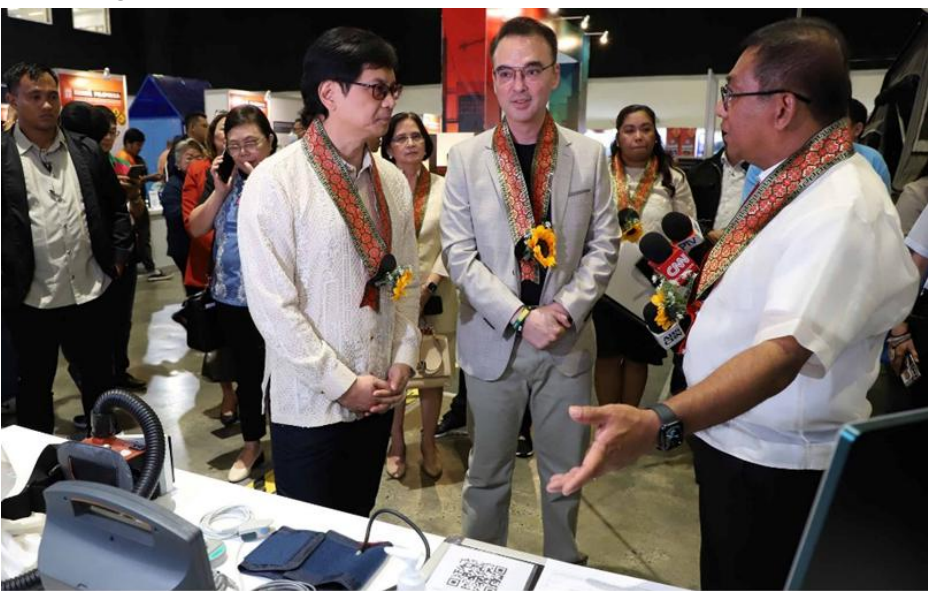
DOST Secretary Renato U. Solidum Jr. gives Senator Alan Peter S. Cayetano and Department of Interior and Local Government (DILG) Secretary Benhur Abalos Jr. an overview on the technologies exhibited in the three-day exposition of Handa Pilipinas 2023 at the World Trade Center in Pasay City.

On a rainy Thursday morning, a momentous event took place at the World Trade Center in Pasay City. Officials from various government agencies, local government units, legislative offices, private sectors, and Filipino researchers and scientists gathered for the opening of the 1st leg of the Handa Pilipinas Expo 2023 that featured disaster risk reduction technologies.