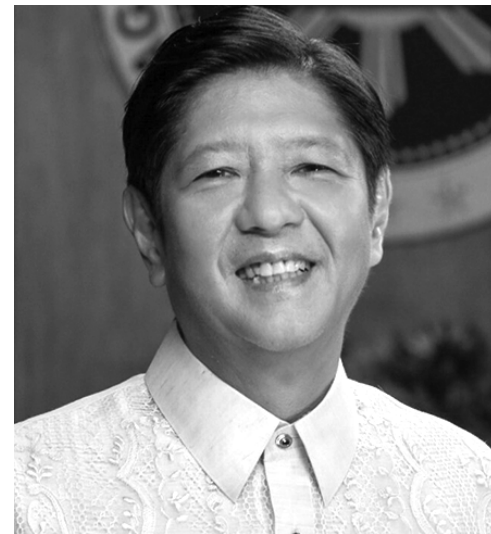
President Bongbong Marcos