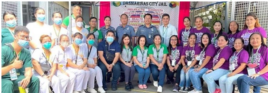
PhilHealth Konsulta Team for Dasmariñas PDLs, with personnel and staffs of BJMP, CSWD, and Pagamutan ng Dasmariñas