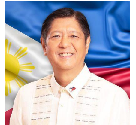
President Bongbong Marcos

"If we will look at the data for the first (semester) of this year, mayroon po tayong negative na 170.5 billion pesos po. Meaning, the national government agencies po was not able to disburse 170 billion pesos po of available funds kaya po bumaba po iyong ating—iyong contribution po ng government spending to our GDP was reduced," she said.