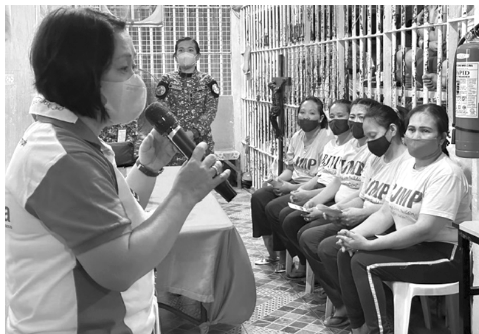
PhilHealth Konsulta Orientation to PDLs of BJMP Dasmariñas Female Dormitory

PhilHealth will continue to reach Filipinos from all walks of life as it commits to provide everyone with equal opportunities and fair chance to a quality health care. No one shall be left behind.