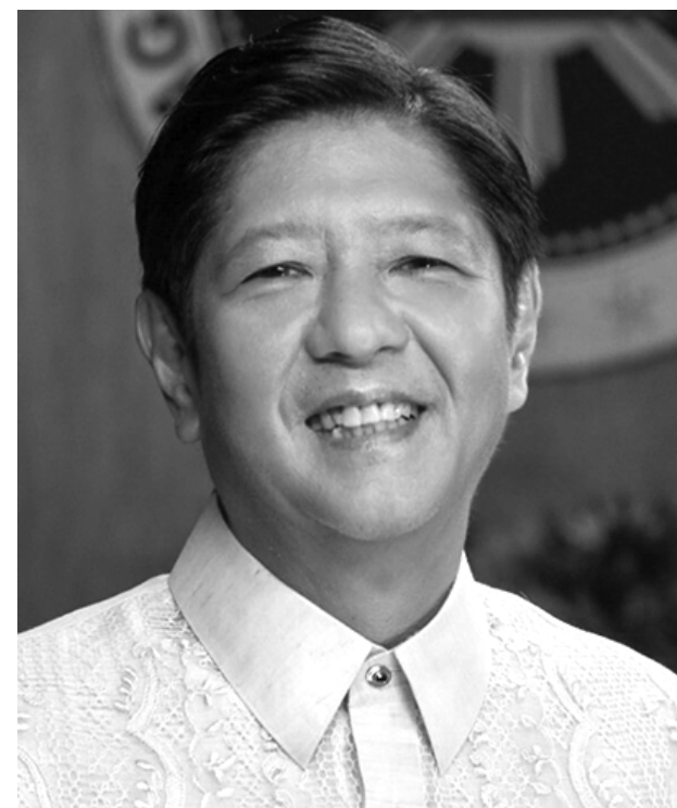
President Bongbong Marcos