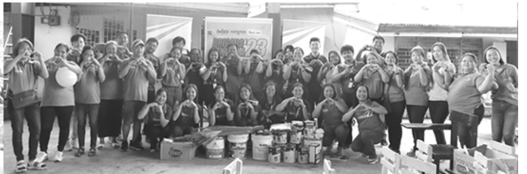
MPT South Volunteers pose with school officials and other community volunteers during Brigada Eskwela at Tibig Elementary School, Silang, Cavite (L) and Gahak-Marulas Elementary School, Kawit, Cavite (r).