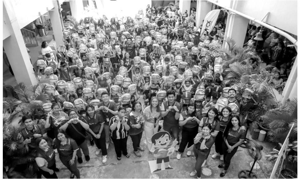
Students of Col. E. De Leon Elementary School in Paranaque received free school supplies to kick off this year's Brigada Eskwela.