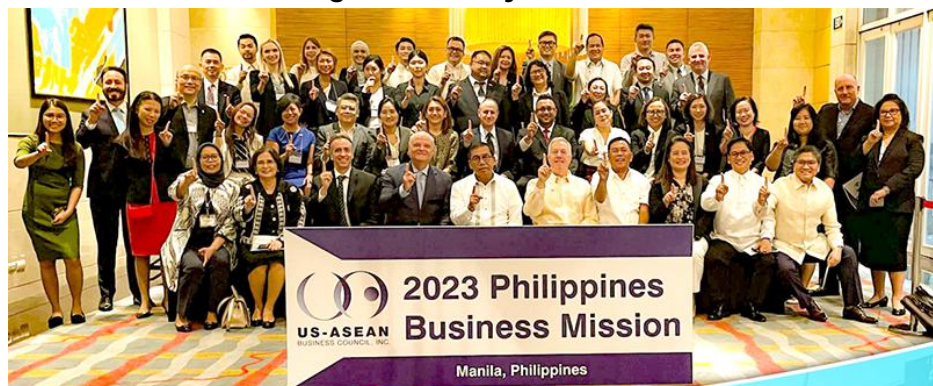
DOST officials, US-ABC executives, and member companies posed for a photo op at the close of the 2023 Philippine Business Mission

Development of Smart Cities, Quantum Technology, Digital Transformation, Advanced Weather Forecasting, and the facilitation of Health Technology Assessment (HTA) initiatives are among the points of interest of the companies during the annual US-ASEAN Business Council 2023 Philippine Business Mission meeting held recently at the Manila Marriott Hotel.