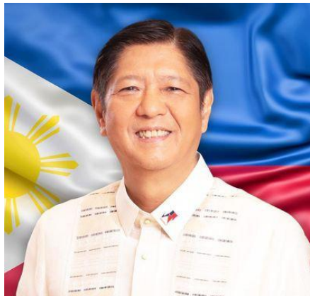
President Bongbong Marcos

Key stakeholders from the agriculture sector in MIMAROPA and Eastern Visayas regions have expressed their support for the issuance of Executive Order (EO) No. 39 by President Ferdinand R. Marcos Jr., which sets price ceilings on rice in the whole country.