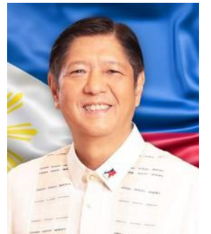
President Bongbong Marcos

Gatchalian said that they expect the number of beneficiaries to increase in the coming days as they target to fast-track the distribution of cash assistance by September 14, or before the Commission on Elections (COMELEC) ▶ DSWD • 7