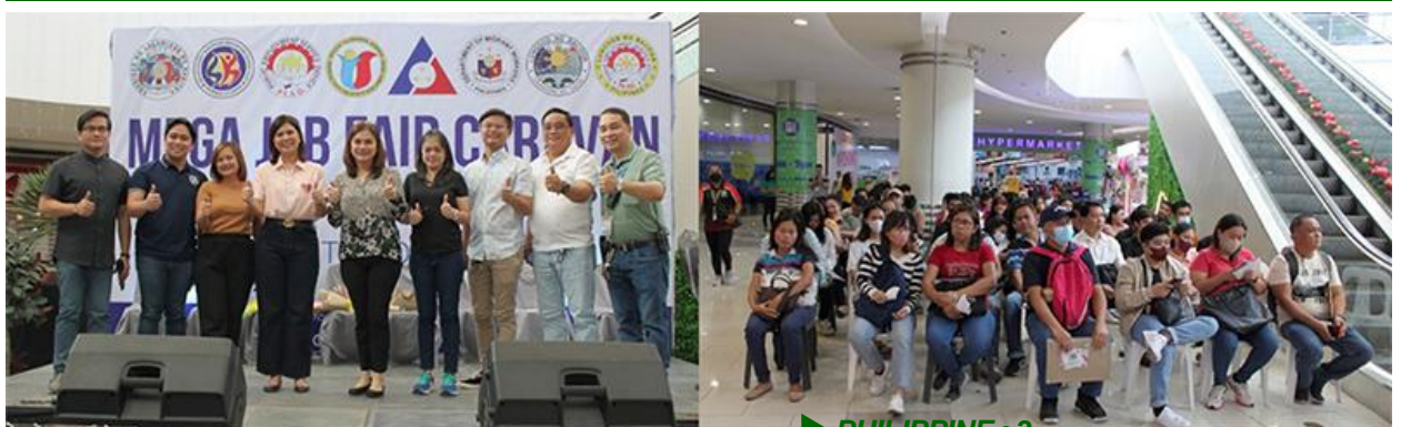
▶ PHILIPPINE • 3