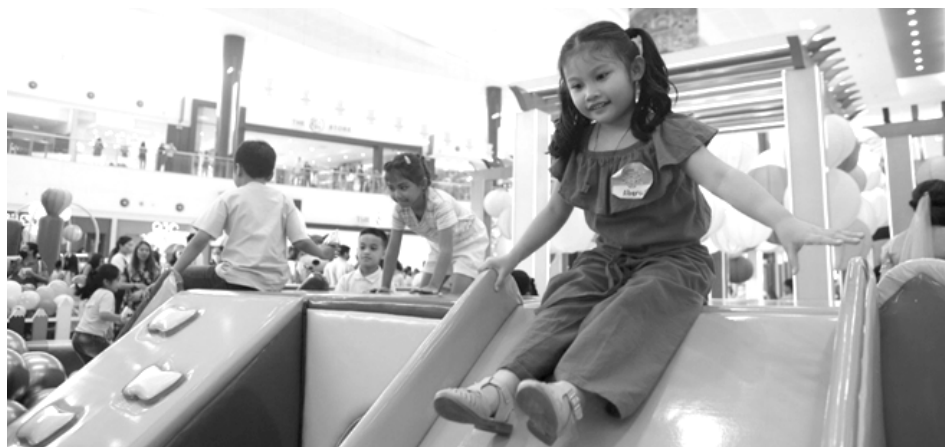
The TODDLER TOWN is for agility of the little ones.