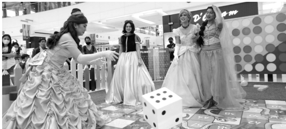
The FUN FACTORY is where kids can enjoy a larger-than-life kid's game.