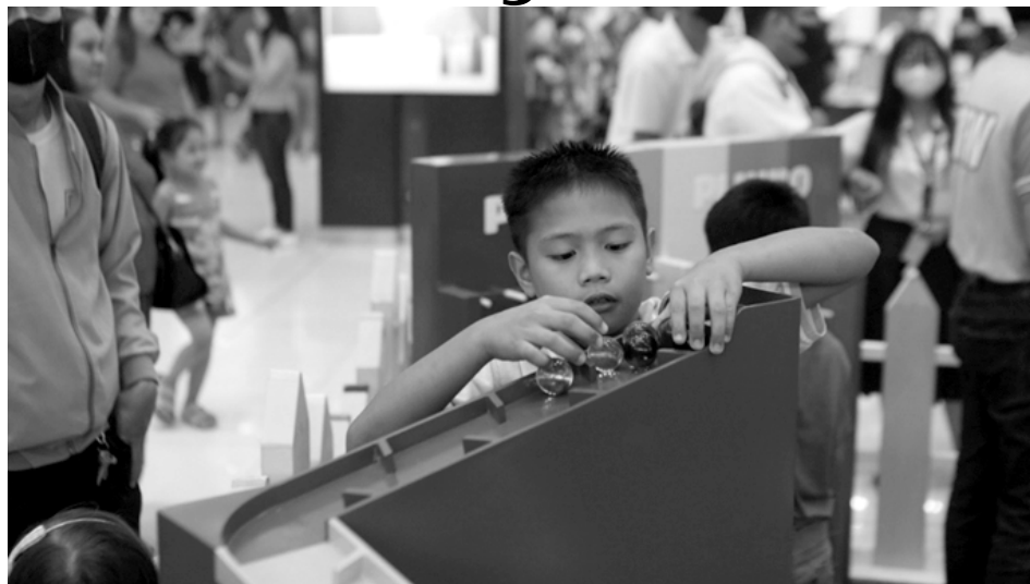
DISCOVERY DEN is to unleash the inner scientist in the kids.