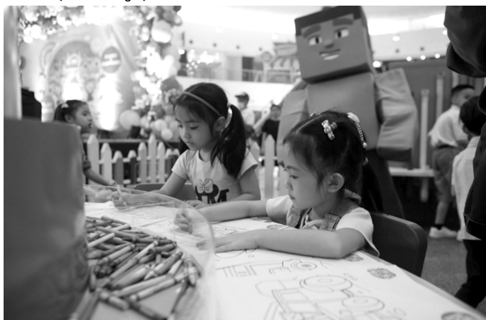
THE IMAGINATION STATION is for children who love art.