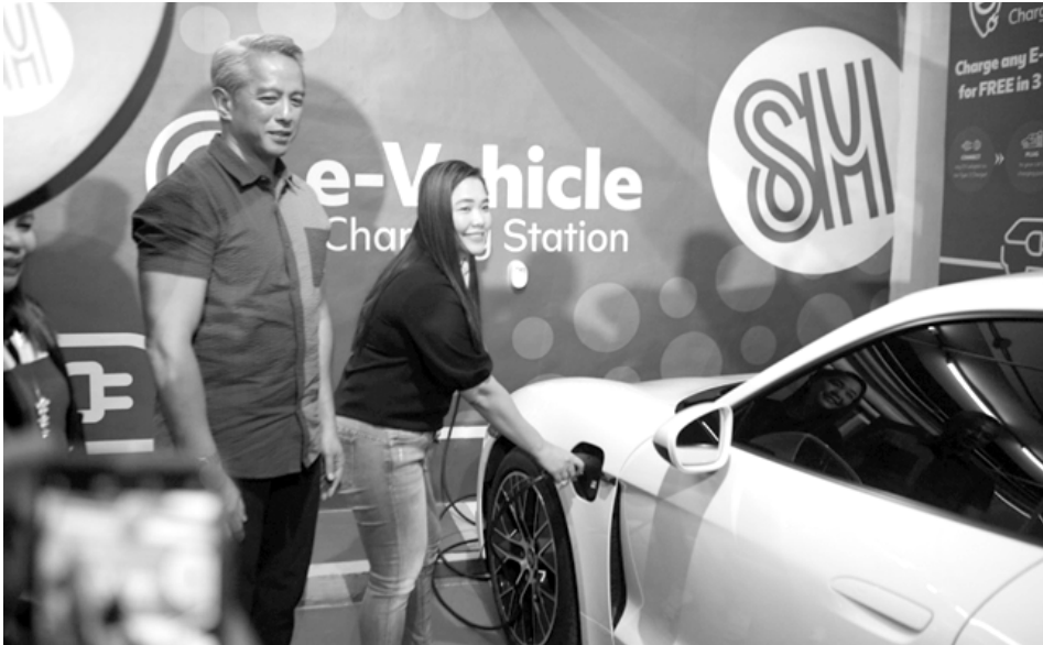
Cavite Governor Jonvic Remulla together with Trece Martires City Mayor demonstrated and tried the e-vehicle charging station at SM City Trece Martires.

Since 2022, SM Supermalls has made traveling anywhere in a sustainable and worry-free way possible! Check out this https://www.smsupermalls.com/electric-vehicle-charging-stations-terms-and-conditions/ to know more about SM Supermalls' EV Charging Stations. And for more news and updates on exciting deals and promos, visit www.smsupermalls.com and follow @smsupermalls on all social media platforms.