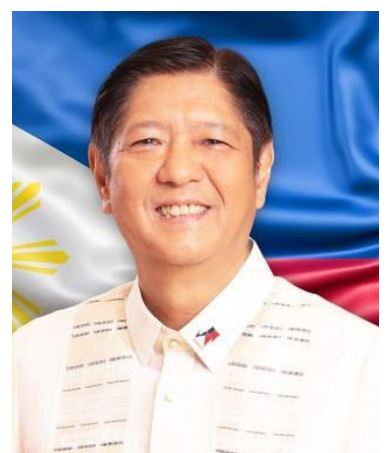
President Bongbong Marcos

President Marcos said that the ▶ PBBM • 3