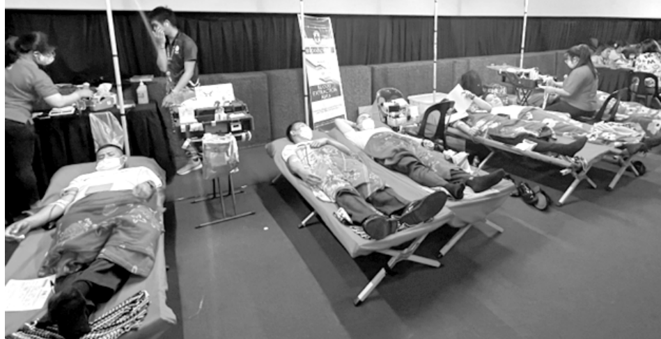
SM Marketmall and SM City Dasmariñas hold blood donation drive - Philippine Red Cross, SM Foundation, SM Marketmall and SM City Dasmariñas recently held a blood donation drive. Shoppers, Tenant and SM employees participated in the event.