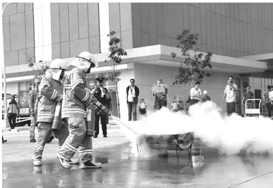
Employees of SM City Tanza participate in simultaneous fire drill by the Bureau of Fire protection Tanza Cavite in line with the celebration of Fire Prevention Month.