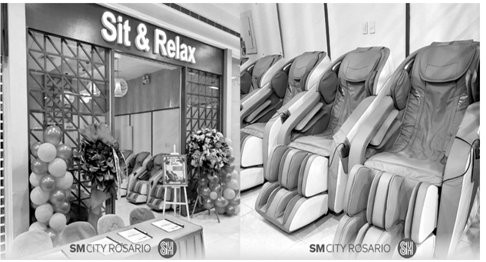
#SMthing NEW here at SM City Rosario! Sit and Relax is now open!! Experience Health and wellness beyond modern living! Visit us at 2nd Level of SM City Rosario Wellness Area.

Sa mga susunod pang artikulo, pag-uusapan ang ilan pang mahahalagang bagay patungkol sa tamang paggamit ng cannabis. Maging buksan ang ating isipan sa marami pang posibilidad at benepisyo ng medical cannabis, na noong sinaunang panahon ay ginagamit nang panggamot sa iba't ibang sakit at karamdaman.