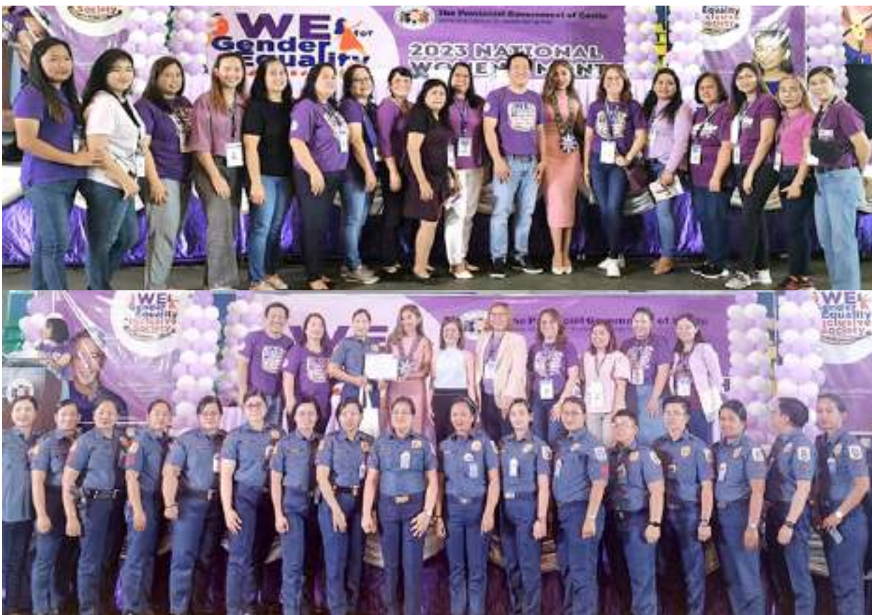
We gender Equality Inclusive society we can be all.

The event which carried the theme "We for gender equality and inclusive society" aimed to continuously support the promotion of gender equality and women empowerment towards the goal of a harmonious and fair society.