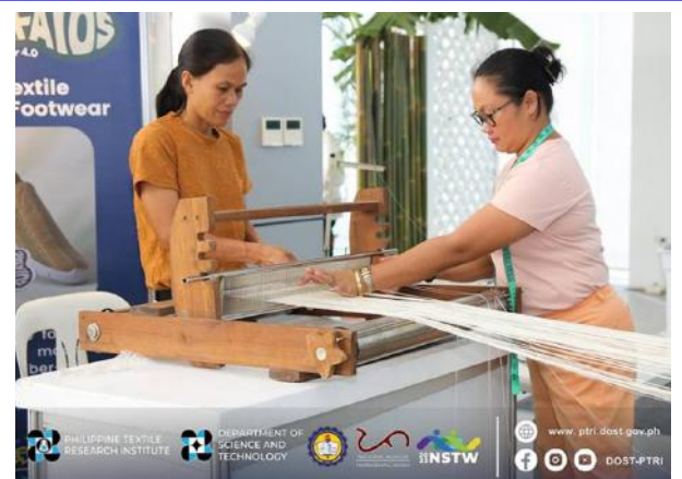
Kuha ng DOST-PTRI sa ginanap na 2023 National Science, Technology, and Innovation Week sa Iloilo City.

The enactment of the PPP Code, or "An Act Providing for the Public-Private Partnership of the Philippines", signed as Republic Act No. 11966, will establish a stable and predictable environment for collaboration between ▶PBBM SIGNS•6