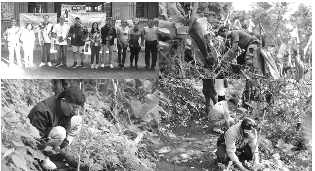
4th Cavite Arbor Day: Cavite greening program continues in Tagaytay City, this time in Barangay Maharlika East and West during the 4th Cavite Arbor Day spearheaded by the Office of the Provincial Environment and Natural Resources (OPENRO) on December 1, 2023 as part of the conservation and rehabilitation of the Taal Volcano Protected Landscape (TVPL). The initiative was participated by the employees of selected PGC offices, officers and staff of PGC Employees and Community Multipurpose Cooperative, personnel from PNP and Philippine Army, non-government organizations, private companies and local officials of Tagaytay City. A total of more than 350 fruit bearing and forest trees were planted along the TVPL in the territorial boundary of Barangay Maharlika. (OPIO)

CAVITE TIMES JOURNAL PAHAYAGAN NG TUNAY NA CAVITEÑO