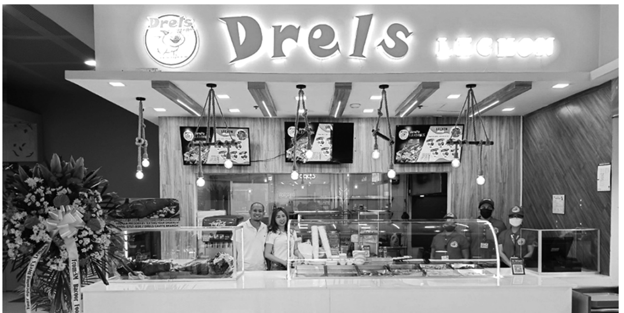
DREL'S LECHON, SERVING: SM CITY BACOR – Stop craving, start indulging with Dre's Lechon as it officially opens at SM City Bacoor Food Court and upgrade your dining experience. Trended as a favorite among celebrities, Dre's Lechon is the perfect choice for both family celebrations and everyday indulgence. Their menu boasts a delectable selection of mouth-watering dishes, including Chopped Lechon, Kaldereta, Kare Kare, and more, all ensuring a burst of flavors that will leave you craving for more. Don't miss the chance to savor the culinary delights offered by Dre's Lechon – visit them at SM City Bacoor's Food Court and treat your taste buds to an unforgettable experience. See you!

The official turnover of the food cart livelihood assistance project is scheduled for December.