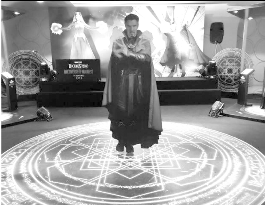
Marvel Studios' Doctor Strange in the Multiverse of Madness (2022) hits Philippine theatres on May 4

Fans can start gearing up for the Multiverse as advance tickets are now available in Philippine cinemas for Marvel Studios' Doctor Strange in the Multiverse of Madness!