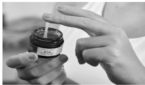
This Edelweiss Bouncy Eye Mask is clinically proven to make eye area and contour look smoother and feel hydrated.

The properties of Edelweiss have been shown to maintain skin barrier health, as well as smooth the skin's surface, helping you keep a radiantly fresh face, whatever your age. That's why Edelweiss is the beauty industry's best-kept secret. The new and improved range has been reformulated to deliver double the concentration of Edelweiss. Edelweiss stem cells and Edelweiss extract which