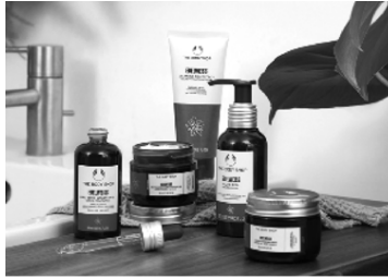
Boost your skin defense mechanism with The Body Shop's new and improved Edelweiss skincare range that has been reformulated to deliver double the concentration of Edelweiss. This includes Edelweiss Cleansing Concentrate, Daily Serum Concentrate, Intense Smoothing Cream, Intense Smoothing Day Cream and Liquid Peel.

The Body Shop has taken the bold move to change the name of its best-selling skin care range, Drops of Youth, to Edelweiss.