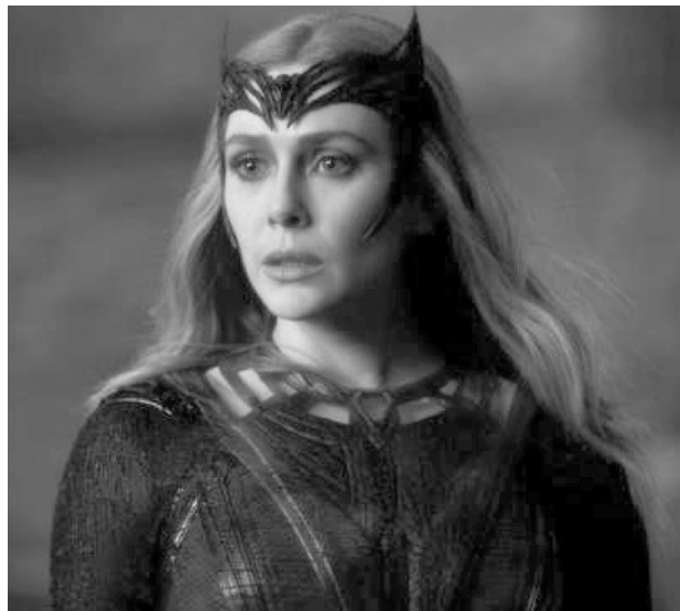
Elizabeth Olsen as Wanda Maximoff in Marvel Studios' DOCTOR STRANGE IN THE MULTIVERSE OF MADNESS.