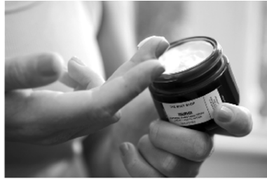
The Body Shop's Edelweiss Intense Smoothing Cream is perfect for drier skin types and helps skin to look re-energized and refreshed every day and night.

The new name also comes with a new formula and extended line-up. The game changer is the Edelweiss extract containing Leontopodic acid, a unique and powerful ingredient that's 60% stronger than ferulic acid, a known antioxidant.