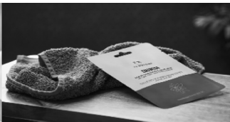
Edelweiss Serum Concentrate Sheet Mask. Just 15 minutes twice a week to help promote fresher, smoother looking skin.

contain hard-working antioxidants are combined with natural-origin peptides, known to boost the skin's defense mechanism and barrier function. While most peptides on the market are synthetic, The Body Shop sources from rice, a natural-origin alternative.