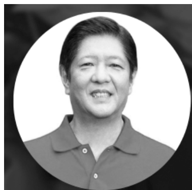
Bong Bong Marcos