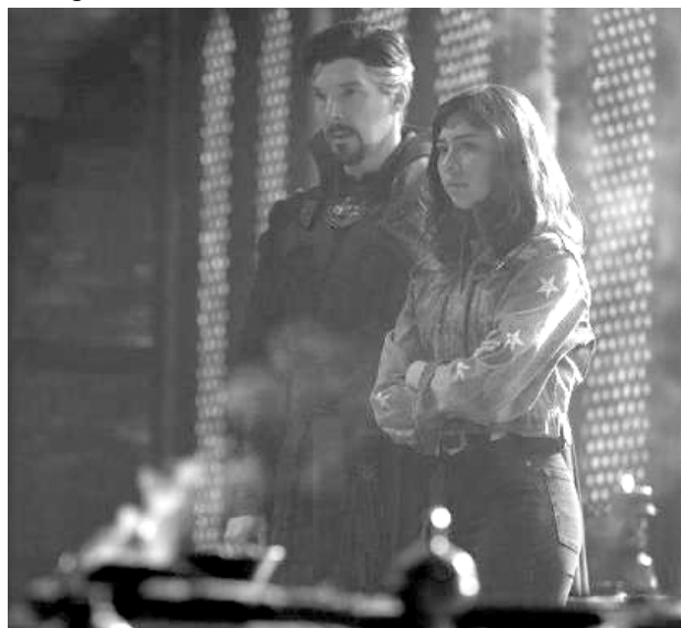
Benedict Cumberbatch as Dr. Stephen Strange and Xochitl Gomez as America Chavez in Marvel Studios' DOCTOR STRANGE IN THE MULTIVERSE OF MADNESS.