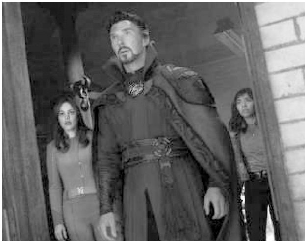
(L-R): Rachel McAdams as Dr. Christine Palmer, Benedict Cumberbatch as Dr. Stephen Strange, and Xochitl Gomez as America Chavez in Marvel Studios' DOCTOR STRANGE IN THE MULTIVERSE OF MADNESS.

Follow Marvel Studios Philippines on Facebook, Instagram, Twitter, and YouTube for the latest news and promos. Join the conversations online using #DoctorStrangePH.