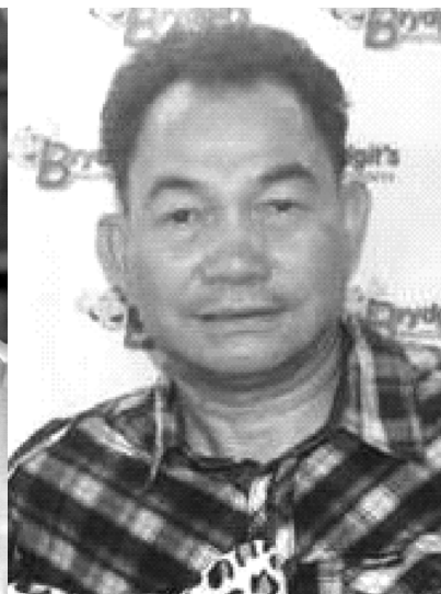
PARDO: Totoo sa serbisyo