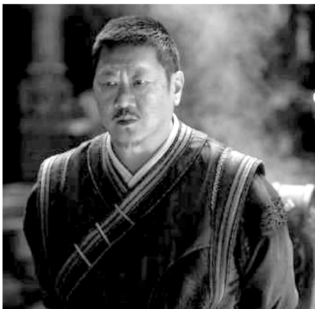
Benedict Wong as Wong in Marvel Studios' DOCTOR STRANGE IN THE MULTIVERSE OF MADNESS.