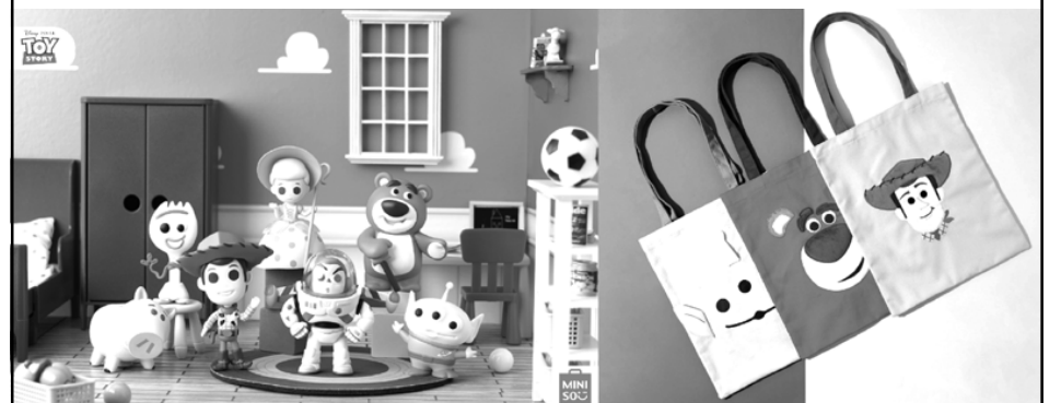
Relive the infinity and beyond fun with Woody and the gang in Miniso x Toy Story Blind Box Collection.

Sheriff Woody, Andy's favorite pull-up cowboy doll and the leader of the group. . . Buzz Lightyear, the space ranger. . . Bo Peep, the porcelain doll . . . Hamm, the piggy bank . . . Forky, the recycled fork toy. These are among the well-loved living toys from Pixar-Disney's iconic Toy Story that kids of all ages can now find in the Miniso X Toy Story collection.