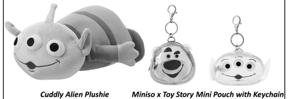
Cuddly Alien Plushie