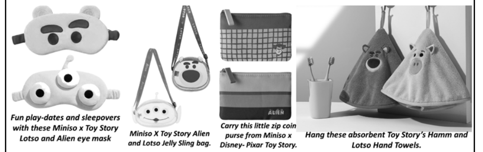
Fun play-dates and sleepovers with these Miniso x Toy Story Lotso and Alien eye mask