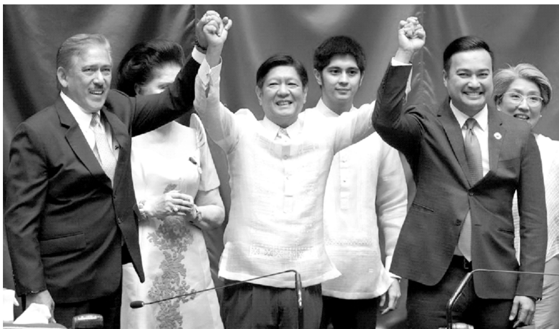
PRESIDENT-elect Ferdinand 'Bongbong' Marcos Jr. (gitna) na itinataas ang mga kamay nina Senate President Vicente 'Tito' Sotto III, at House Speaker Lord Allan Velasco sa ginawang proklamasyon sa pagkapanalong pangulo sa nakaraang eleksiyon, Lunes, Mayo 9. Nasa larawan (bahagyang natatakpan) si dating First Lady Imelda Marcos, anak ni Marcos Jr. at dulong kanan, ang kapatid ni BBM, si Irene Marcos-Araneta.

MATAPOS ang tahimik na canvassing ng mga boto, ipinaroklamang nanalo bilang presidente si dating Sen. Ferdinand 'Bongbong' Marcos Jr. at nanalong bise presidente si Davao City Mayor Sara 'Inday' Duterte-Carpio sa magkasamang pulong ng House of Representatives at Senado nitong Miyerkoles, Mayo 25.