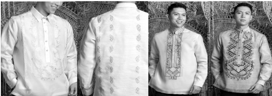
Jusi barong with embroidery details on sleeves and back.