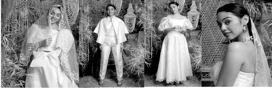
FILIPINIANA FOR THE MODERN BRIDE. Amor embroidered calado cropped top with terno sleeves, silk cocoon skirt with a ruffled hem, and embroidered veil from Kultura.

Filipinos love weddings! Perhaps it's because of the romantic in us and these have a way of bringing families and friend together. While many still prefer traditional weddings, new concepts like destination weddings and ready two wear bridal gowns have become popular in recent years.