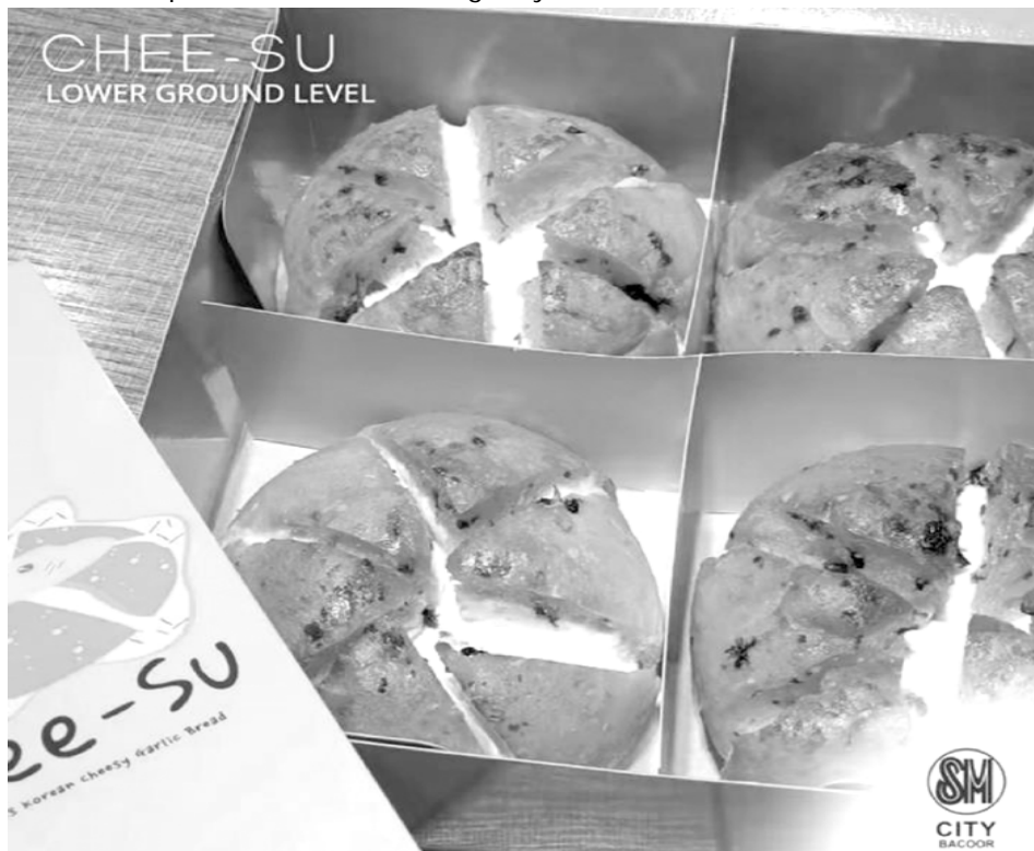
K-RAVING SATISFIED AT CHEE-SU SMCITY BACOR, CAVITE - Get cozy with your favorite korean cheesy garlic bread this rainy season. Head on to Chee-su at SM City Bacor located at the ground floor level for that yummy Korean bread craving! Serving it fresh and hot just for you. Enjoy!

Kultura store locator: https://www.kulturafilipino.com/pages/store-locator ; Shop online: www.kulturafilipino.com ; Call To Deliver: 09175174096 or 09676093407