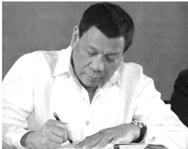
Pinirmahan na ni Pangulong Duterte ang Universal Health Bill

Lahat ng Pilipino ay sakop ng Batas na ito. Bahagi na umano ng adbokasiya ng gobyerno ang otomatikong tulong kahit hindi mag-apply, pumila o humingi ang mga mamamayan. Ito umano ang programang nakapaloob sa nilagdaang Universal Health Care Law ni