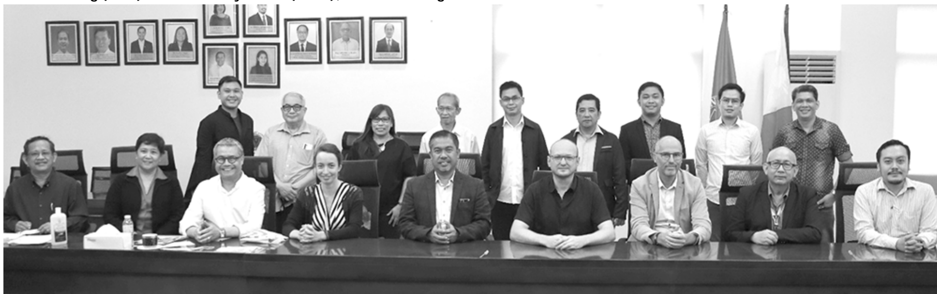
PHOTO: BatStateU officials and delegates from University of Lille during the MOU signing and discussion ceremony.

BATANGAS CITY – Batangas State University (BatStateU) further widens its international linkages and partnerships after signing a Memorandum of Understanding (MOU) with University of Lille (ULille), France to strengthen academic and research collaboration on June 29.