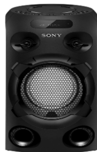
High performance Sony V02 One Box Audio System with Bluetooth technology for your favorite music playlist.

Stay connected with family, friends, and associates with smartphones like the foldable and water resistant Samsung Galaxy ZFold 3 with unrivalled camera zoom, big storage capacity and long battery life. With its Flex Mode feature, it splits the large screen into two or three apps at once for instant multitasking. Taking best