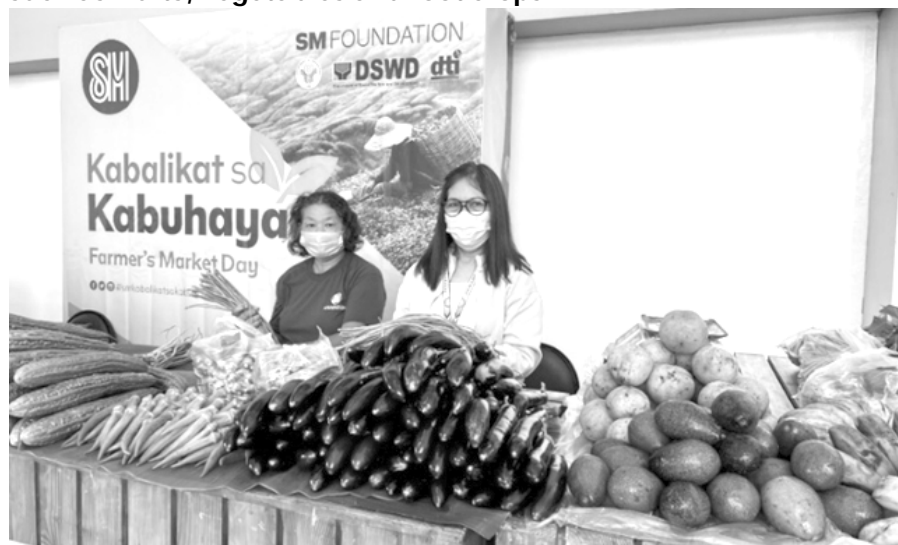
Kabalikat sa Kabuhayan Farmers and their quality produce.

SM Foundation Incorporated launched a sustainability opportunity for the farmers of Kabalikat sa Kabuhayan, a project dubbed as the "Kabalikat sa Kabuhayan Farmers' Market". The project aims to help and support local farmers in selling their fresh produce at SM Supermalls. The Farmers' Market is exclusive to the graduates of the Kabalikat sa Kabuhayan Farmers Training program. SM City Dasmariñas recently opened its doors to the local farmers of Dasmariñas City Cavite who underwent Kabalikat sa Kabuhayan Farmers Training in previous years and are now small-scale farmers, doing farming as their source of income. The mall management provided the farmers with a rent-free high foot traffic location and carts to display agricultural products such as fruits, vegetables and root crops.