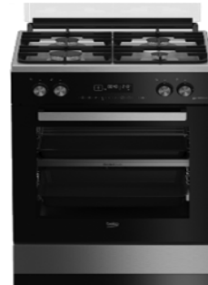
This Beko Range (FVR62630DXDTL) features 4 special burners and a multifunctional oven for a faster and more efficient cooking experience.