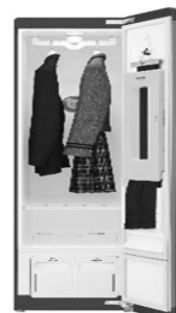
This innovative LG Inverter Styler sanitizes clothes up to 99.9%.