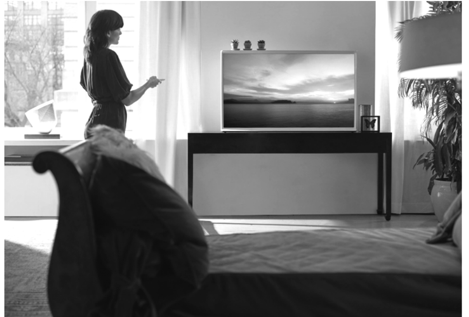
Enjoy watching your favorite movies and TV shows with this stylish 43-inch Samsung The Serif 4K TV with its 360 All Round Design. You may place The Serif literally anywhere in the room because of its Detachable Floor Stand. One (1) lucky winner can bring home this Samsung The Serif TV. Check out Gadgets Everyday Raffle Promo.

Whether at home, at the office, or on the road, gadgets have made our lives easier, more convenient, and even happier – as in the case of home entertainment – through the most creative of innovations and the most advanced technology.