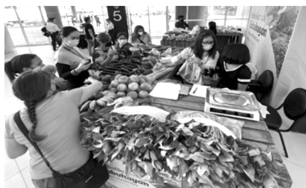
SM Dasmariñas shoppers visit the Kabalikat sa Kabuhayan Farmers' Market booth and buy freshly-picked fruits and vegetables.

These good quality products are freshly-picked from their small farm and are ready for selling every Friday at Entrance 5 lobby of SM City Dasmariñas. SM Foundation's Kabalikat sa Kabuhayan is a 14-week long agri-training program that teaches participants basic and advanced organic farming techniques and agripreneurship. It is a sustainable agriculture program that uplifts the lives of its stakeholders and benefits the community as well.