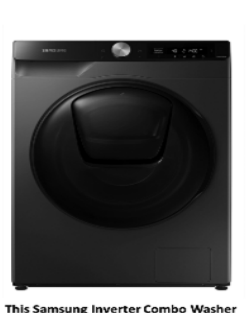
This Samsung Inverter Combo Washer Dryer Washing Machine features an eco-bubble, an air wash and AI control technology that cleanses your clothes easily and effectively with superb laundry care.

night shots also made easy with premium Samsung Galaxy S22 Ultra series Nightography camera feature. The Samsung Galaxy ZFlip 3 that folds to fit small-sized pockets can also be found at SM Appliance.