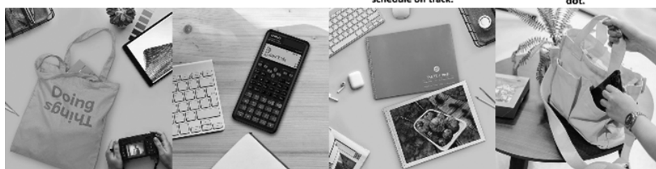
Fun colored totes for your school stuff. Available at SM Stationery.