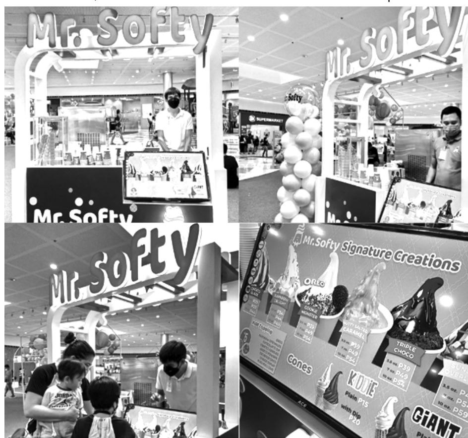
SM CENTER IMUS

Follow @smstationeryph on Facebook and @smstationeryph on Instagram for more exclusive deals and updates!