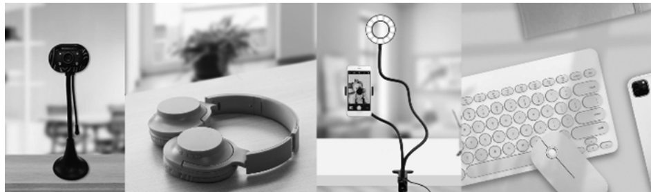
Stay selfie ready with this webcam with stand.

Whether your kids are bound to attend face to face or virtual classes, SM Stationery has all the school stuff a student needs for the back to school season.