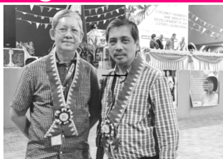
COCONUT FARMERS AND INDUSTRY DEVELOPMENT PLAN (CFIDP) LAUNCHING