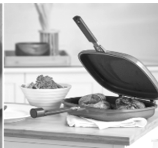
Happy Call Double Pan Jumbo Grill. This non-stick silicon double pan jumbo grill makes mealtimes happy by making food crispy on the outside and juicy in the inside.