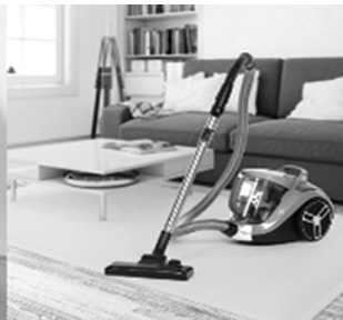
Tefal Compact Power Cyclonic Bagless Vacuum Cleaner. A vacuum with a compact design and a 2.5 dust capacity container ready for extreme cleaning performance. It's dual-surface suction head and longer cord length makes cleaning a breeze.