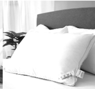
Akemi Medi + Health Aloe Vera Soft Touch Memory Pillow. A unique pillow that promotes health and a good night's sleep with its innovatively cooling cover, nice scent and a comfortably conforming visco elastic foam core.