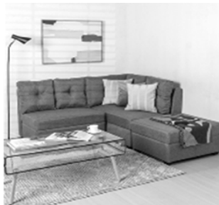
Cheer Sectional Sofa Set. Stylish and elegant L-shaped sofa which gives you more reason to relax at home. Armrest and backrest and padded with Polyurethane foam.

Now is the time to create your dream home as SM Home launches its Home Sale this August! You'll love the great finds and great bargains up to 50% off from select items from August 1 to 31 at all SM Home branches at SM Stores nationwide.