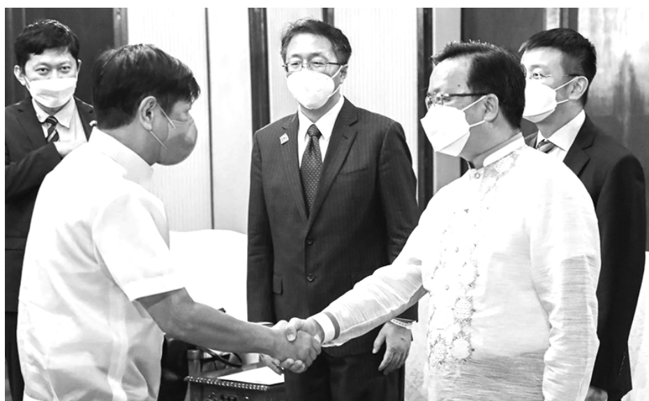
MASAYANG tinanggap at nakipagkamay si Presidente Bongbong Marcos Jr. kay Chinese Ambassador Huang Xilian sa pagbisita sa Malakayang nitong Miyerkoles.