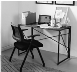
Hosh Gorky Harper Computer Desk. A basic design for the study or home office for contemporary compact homes.