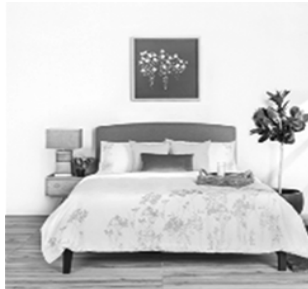
Margaret Muir Alba 4 pc Duvet Set. Beautifully designed Egyptian cotton bed linen set makes sleeping more comfortable. Includes a duvet, a fitted sheet and 2 pillowcases.