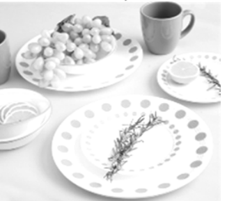
Corolle Livingware South Beach 16 pc dinnerware Set. Knowing the quality of Corolle, These lightweight high quality plates, bowls and stoneware mugs inspired by Miami South Beach's iconic colors are perfect for fun and casual dining.