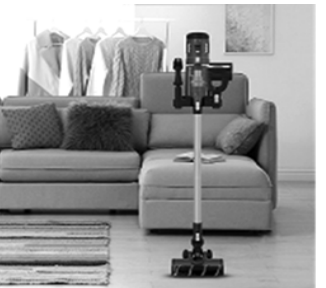
Tefal Airforce Vacuum. If you're looking for an ultra-light and compact vacuum, this can be your cleaning buddy. Offers 3 levels of filtration, motorized soft head ideal on hard floors and it could run 30-minutes handheld in normal power mode.