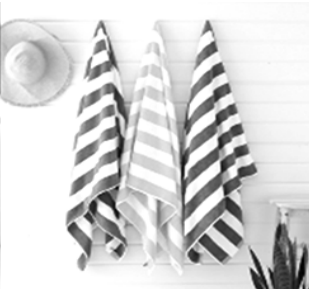
Royal Linens Towels. High quality cotton combed towels for that 5-star hotel experience.