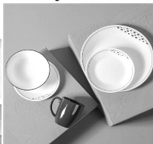
Corolle Livingware Fusion Cobalt 16 pc dinnerware Set. These lightweight high quality plates, bowls and stoneware mugs are perfect for fun and casual dining.