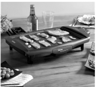
Tefal Plancha Compact Grill. Perfect for home grill parties, family outings and reunions, as well as samgyup cravings, this versatile non-stick grill has a juice tray that has an adjustable and removable thermostat and dishwasher safe.

There are stylish and affordable furniture pieces for your home or home office, as well as innovative appliances for gracious living. Entertain in style with elegant