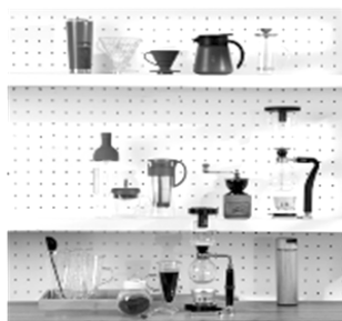
Hario Coffee and Tea Equipment. Enjoy coffee or tea at home or in the office with these high-quality glass and ceramic coffee and tea equipment and accessories from Hario.