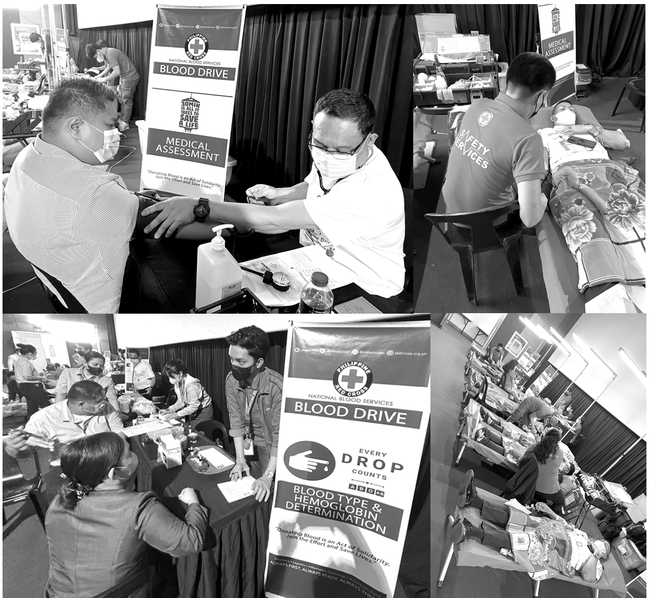
The Philippine Red Cross Cavite chapter recently held its second round for 2022 of blood donation drive at SM City Dasmariñas. Customers, tenants and employees participated in this campaign. This was once again a very significant event at the mall amidst an increasing number of dengue cases in Cavite. Donating blood will surely save lives

NOTE: All news articles and opinions expressed by the writers are entirely their own and do not reflect the opinion of the Publisher, Management of this Publication.