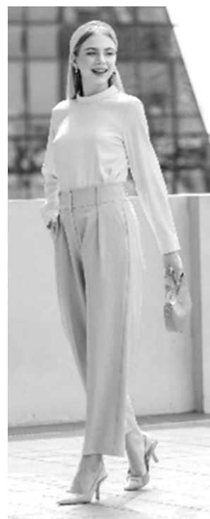
Dress up for work wearing different pieces together that fall within the same color from the SM Woman Department.

Preppy styles, on the other hand, highlight business comfort. Think relaxed cardigans and jackets, and slacks paired with sling bags, backpacks, duffle bags, leather shoes, loafers and watches for men. There