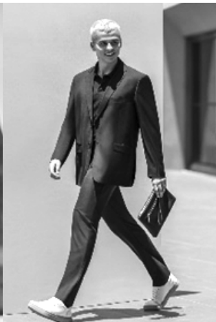
Head back to the office comfortably with work leisure style outfits for men. Maxwear blazer, Baleno shirt, Mainstreet pants all paired with a leather clutch, and two-toned sneaker. All available at the SM Store.