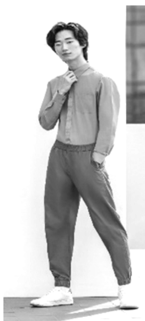
Contemporary classics. Mainstreet shirt, Baleno pants, Salvatore Mann Bag and Milanos shoes from SM Store's Men's Department.

best for more traditional office arrangements. It combines simplicity with elegance like SM Woman's Prima collection worn with Parisian's heels, pumps, bags and Raya's set of earrings and necklaces. For men, there are dress shirts and pants from