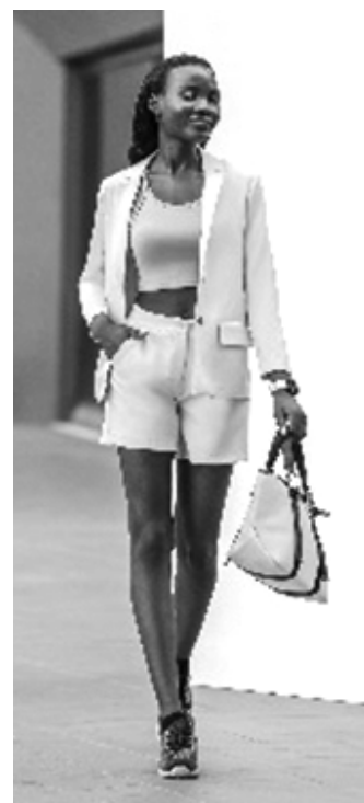
Workleisure outfits combine corporate style with athleisure attitude like wearing blazers, shorts, active sports bras matched with nylon tote and sneakers from SM Store's Woman's Department.

Workleisure outfits underscore how lines have blurred between working and living by combining corporate style with an