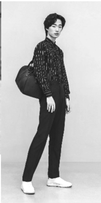
Corporate basics – a dress shirt and slacks available at SM Store's Men's Department.

Like the new way of going to work, dressing up for the office is in a sense-hybrid. Some brands call it "power casual" or "business comfort". Heels are lower, silhouettes are more relaxed, and Silicon Valley execs are said to be wearing graphic tees