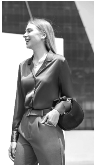
Minimalist memo. Monochromatic satin blouse and pants from SM Woman paired with Raya jewelry and a Parisian bag.

Workwear has evolved through the years from Wall Street pinstripes to Silicon Valley casual. With many more heading to the office after two years of WFH arrangements, welcome to the new world of workwear at SM Store.