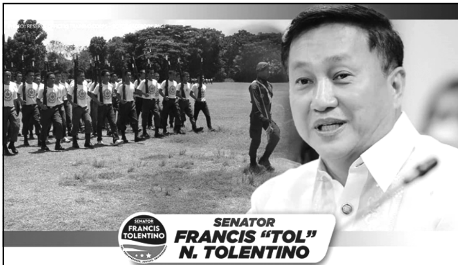
SENATOR FRANCIS "TOL" N. TOLENTINO