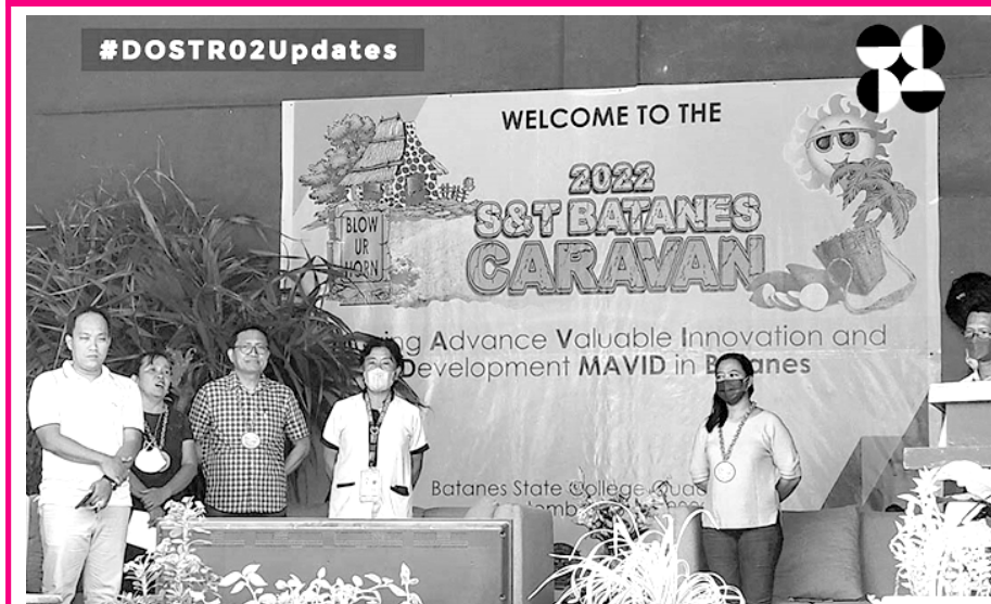
Basco, Batanes – The Department of Science and Technology (DOST) Region 02 thru the Provincial Science and Technology Office (PSTO) in Batanes officially opened the 2022 S&T Caravan, last September 14.

This year's S&T Caravan bannered with the theme "Moving Advance Valuable Innovations and Development (MAVID), which means DOST Region 02 is pushing forward in intensifying its implementation of the