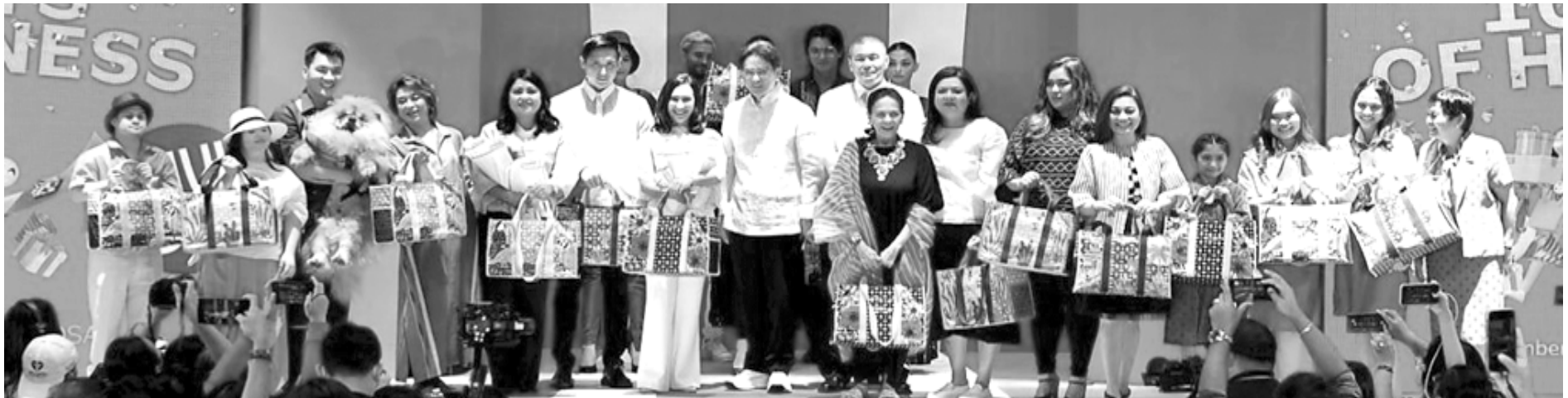
In photo: men and women of substance from the Quezon City LGU, SM Supermalls, Girl Scouts of the Philippines, Brownies Unlimited, Spark PH, and Down Syndrome Association of the Philippines