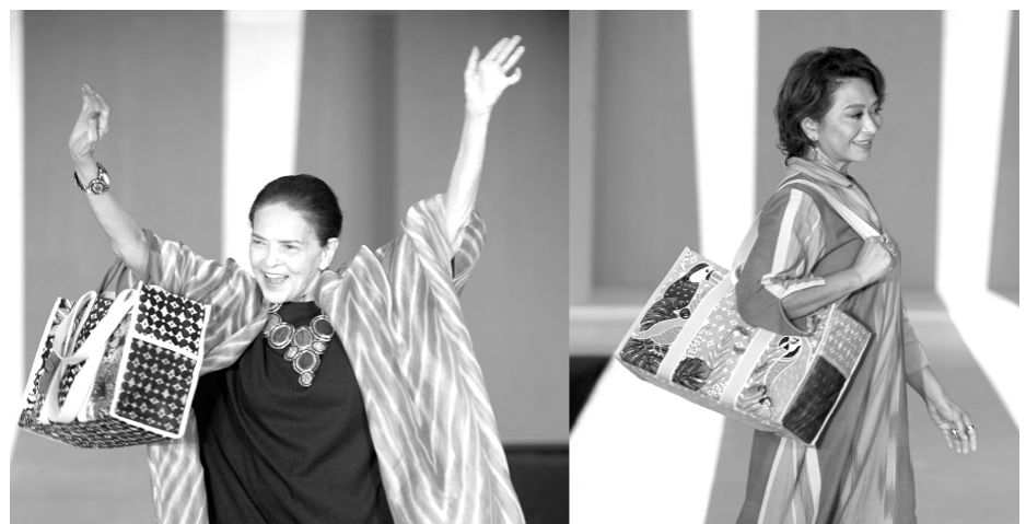
Women of Substance Gina Pareño and Ces Drilon walk the runway to show support for the 100 Days of Happiness' causes and initiatives.