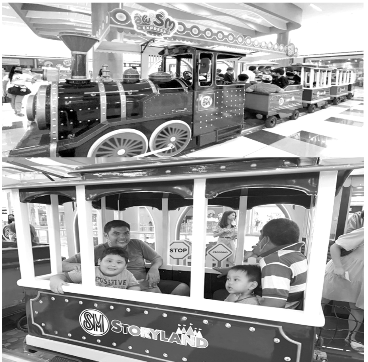
Take an awesome ride with SM City Trece Martires' AweSM express! SM City Trece Martires lets you experience an awesome adventure ride with the AweSM express which recently launch at the 2nd level. Check out the newly improved AweSM Express now with longer ride and trail that will surely excite kids, teens and even adults!

CAVITE TIMES JOURNAL PAHAYAGAN NG TUNAY NA CAVITEÑO