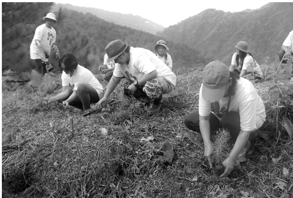
People's Organization NAMALISA plant trees at the launch of Grow Trees Community in Tuba, Benguet.