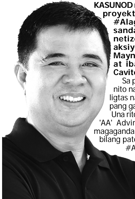
Imus City Mayor Alex Advincula

investments sa ating lungsod, at naglaan ng pondo para sa 29 priority projects para sa ating mga kababayan."