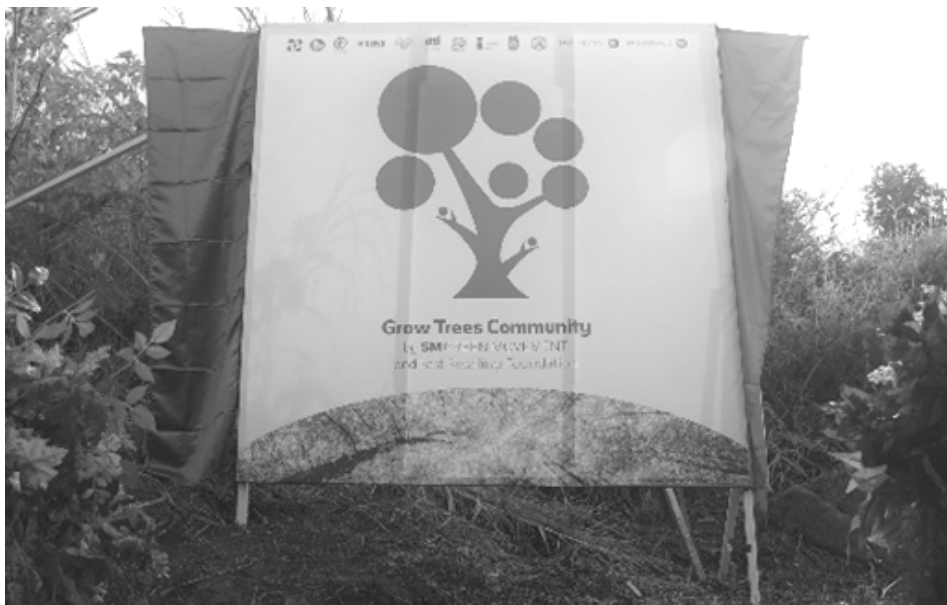
Grow Trees Community was previously launched in Nasugbu, Batangas and Macabebe, Pampanga. Across the three locations, the project aims to plant over 200,000 seedlings and propagules.