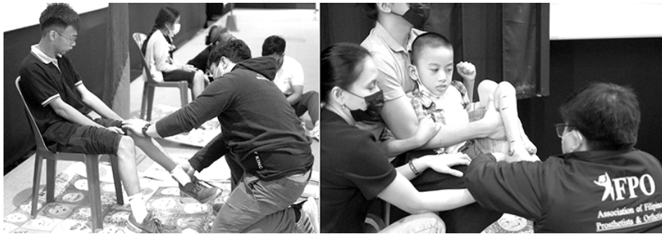
Children with Cerebral Palsy received free assessments and casting through volunteer doctors.

To learn more about these programs, visit www.smsupermalls.com/smcars .