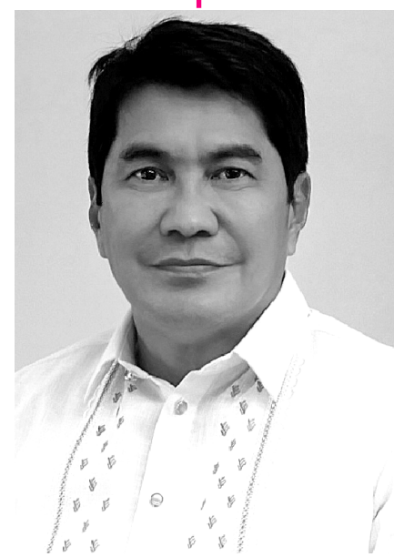
DSWD Sec. Erwin Tulfo

Sinabi ni Tulfo na taliwas ito sa utos ng Pangulo na gawing magaan at mabilis ang pamamahagi ng tulong, lalo na sa panahon ng kalamidad, ► 2 OPISYAL • 5