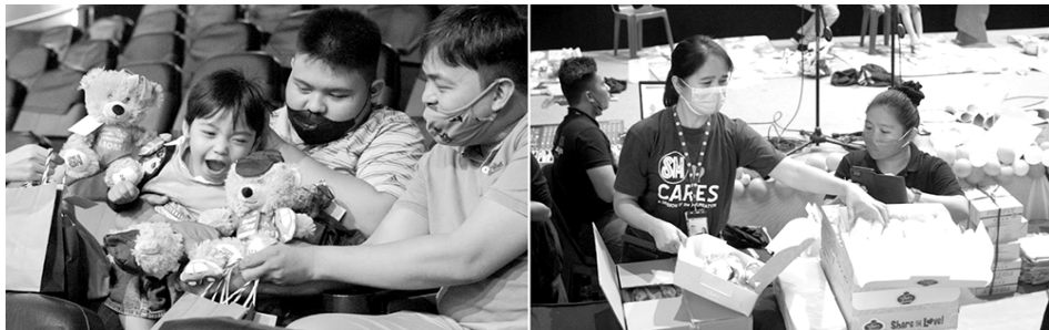
Bears of Joy, gifts, food and entertainment were provided by SM employees and various partners.