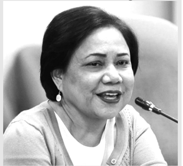
Upang mawala ang galit ni Sen. Cynthia A. Villar, aba, wag nyong pakikialaman ang mga ilog niya sa Las Pinas City.

Sundan pa ang isyung ito sa aking next column at para sa inyong reaction, mag-email lang sa taparaneliseo@gmail.com o sa lukasdasilva990@gmail.com