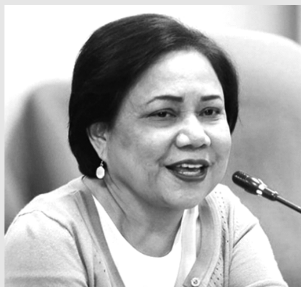
Senator Cynthia A. Villar

Saka po, yung proyekto, madam senadora ay tugon at pagsunod sa utos ng SC sa DENR sa iba pang ahensiya ng gobyerno at LGUs (kasama rito ang Las Pinas, Deputy Speraker and Las Pinas City Congresswoman Camille Villar) na ang sabi, "xxx to clean up, rehabilitate, and preserve Manila Bay, and restore and maintain its waters to make them fit for swimming, skin-diving, and other forms of contact recreation."