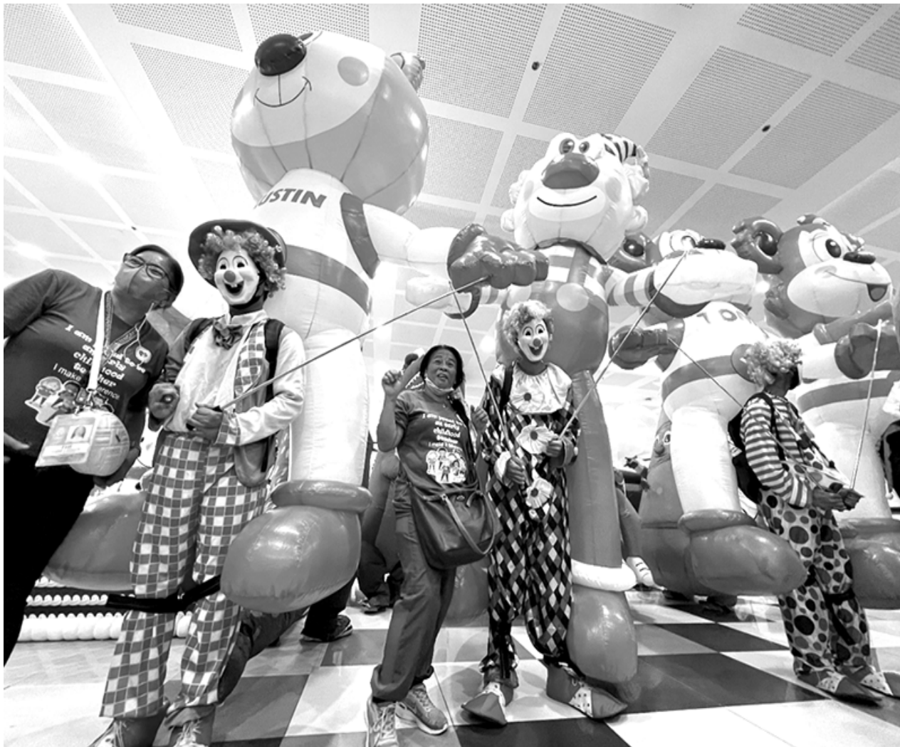
Mascots greet SM City Trece Martires' shoppers: Giant colorful mascots paraded at SM City Trece Martires during its 3 day sale event. Kids and kids at heart got the chance to take photos with them. These mascots made the event festive and exciting. Visit SM Trece Martires and SM City Rosario to catch them again live. Check out their FB pages for details.