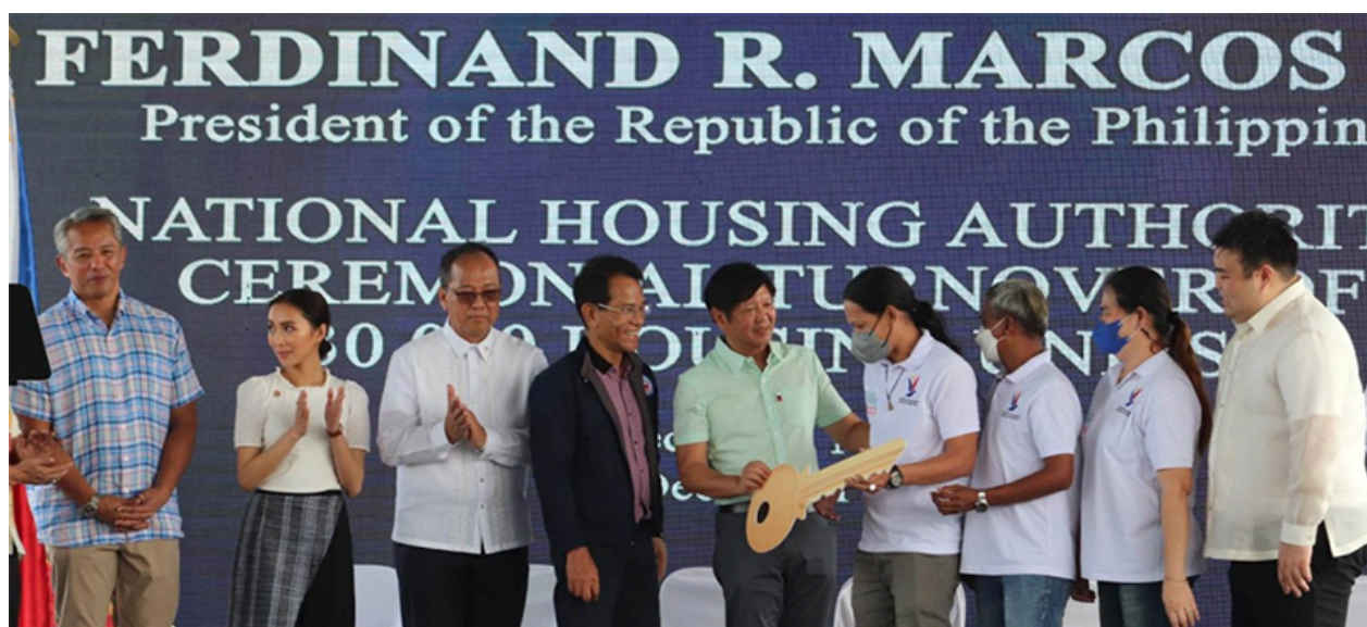
Nakangiti si Presidente Bongbong Marcos kasama si Cavite Governor Jonvic C. Remulla Jr. habang iniaabot ang malaking susi na simbolo ng pagmamay-ari sa isang benepisyaryo ng murang pabahay ng NHA sa okasyong ginanap nitong Lunes, Disyembre 5, sa Barangay Calubcob, Naic.

SA daan-daang pabahay na ipinagkaloob sa mahihirap at walang bahay sa Barangay Calubcob, Naic, mayroon bang lehitimong residente ng bayang ito ang naging mapalad na benepisyaryo?