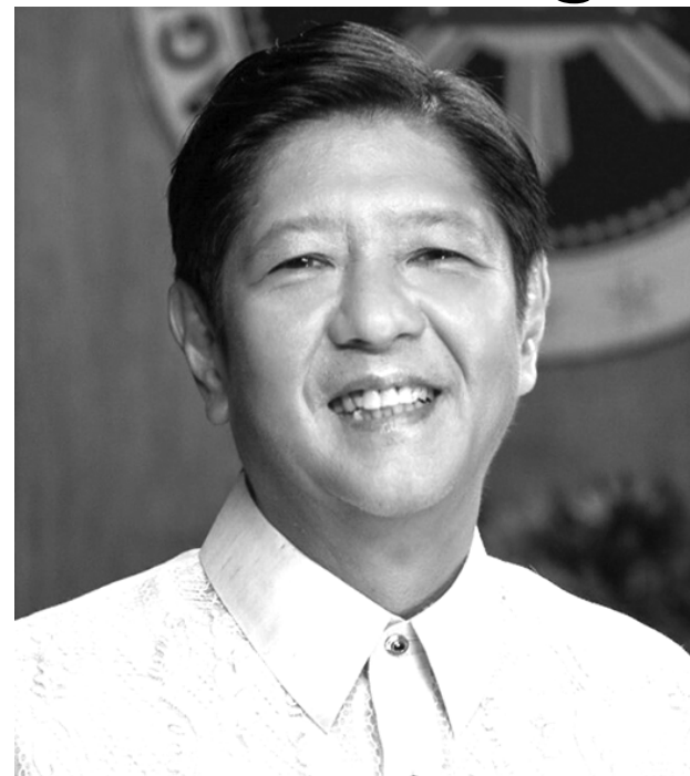
President Bongbong Marcos

The President also thanked the Department of Budget and Management (DBM) for its efforts in passing the government spending program for next year.