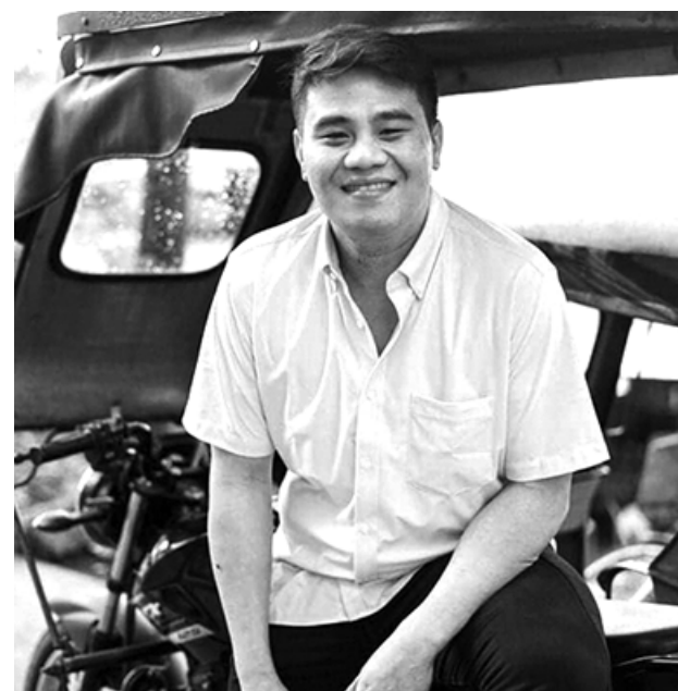
Kawit Mayor Aguinaldo

He thanked the Sangguniang Pambayan, all heads of offices and all government employees for