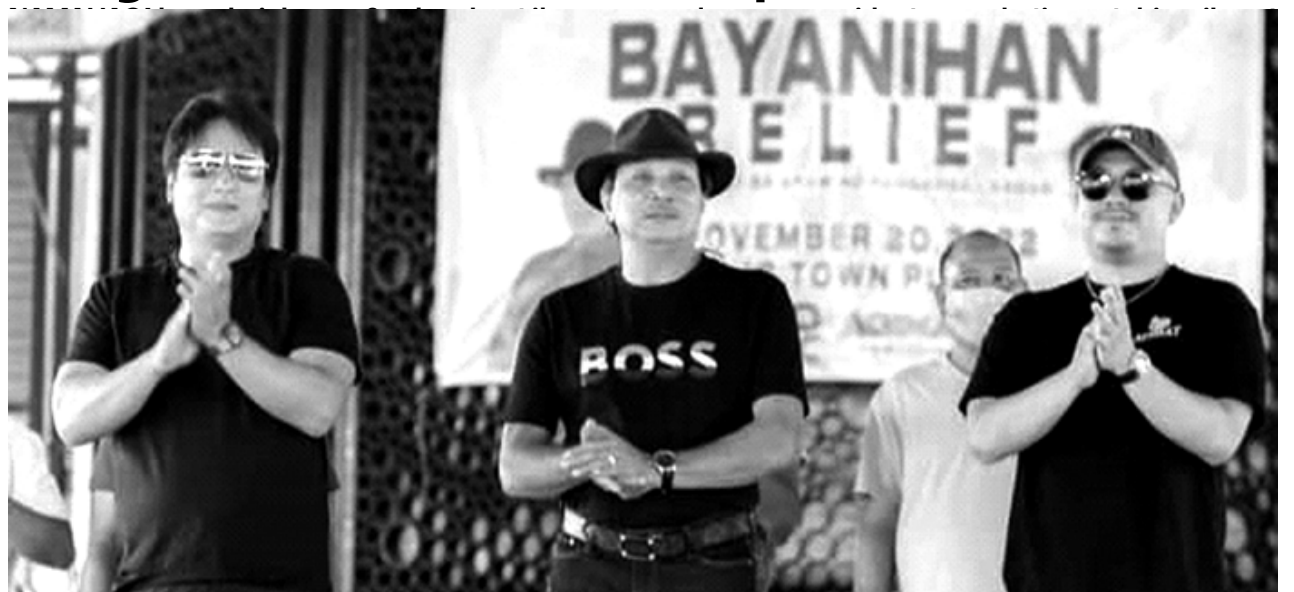
Laging handang tumulong: Mula sa kaliwa-- Sen. Bong Revilla, Naic Mayor Raffy Dualan, at Agimat partylist Rep. Bryan Revilla.