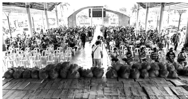
Maraming salamat po sa Bayanihang tulong sa Naicqueno.