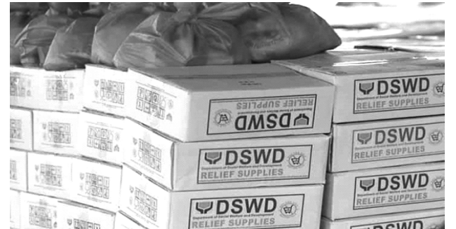
Mga paketeng naglalaman ng tulong mula sa Department of Social Welfare and Development (DSWD).

Ginawa ang aktibidad sa town plaza, katuwang ang lokal na opisina ng Municipal Social Welfare and Social Development Office (MSDWO) at iba pang opisyal ng lokal na pamahalaan upang kahit paano ay makagaan sa pinsalang idinulot sa mga apektadong residente ng bagyong 'Paeng.'