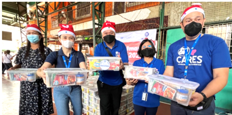
Dasmariñas Residents receive Christmas cheers - SM Cares, together with SM Marketmall and SM City Dasmariñas, shared Christmas Cheers to 300 families of Barangay Buro 1 in Dasmariñas City Cavite.

CAGAYAN DE ORO CITY – To foster a food safety culture and to assist in the provision of opportunities for out-of-school youths, the Department of Science and Technology regional office 10 grants four solar-powered vending carts to selected five out-of-school youth on November 17 at the University of Science and Technology of Southern Philippines. ► DOST • 5