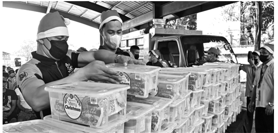
SM City Bacoor CRS SMERT and Agency personnel arranging the Holiday Baskets before distribution.

Indeed, Christmas is more meaningful when we share the blessings to those who need a little cheer for the holiday.