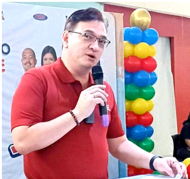
Pinangunahan ni Mayor Strike Revilla ang pagbukas ng satellite offices sa Main Square Mall nitong December 19, 2022.

INAASAHANG bago matapos ang Disyembre o sa unang linggo ng Enero 2023, mabubuksan na sa publiko ang ilang mahahalagang satellite offices sa Bacoor City Government Center.