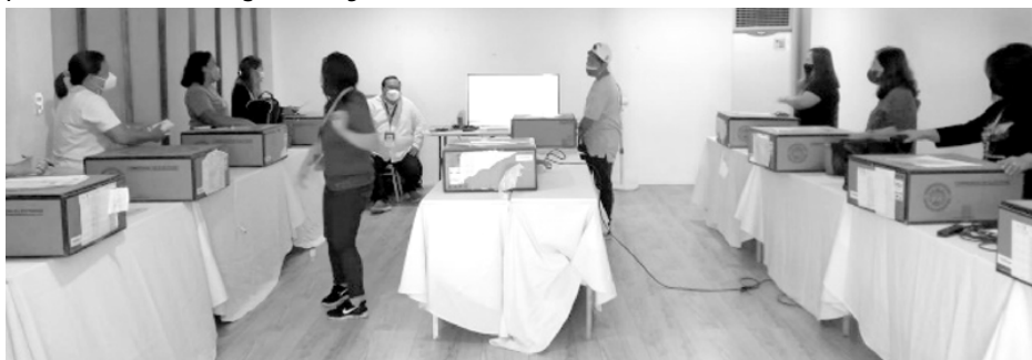
EB Certification in Cavite

This is the fifth time that DOST handled the EB certification. There will be more than 210,000 EBs to be certified all over the country with the CALABARZON having the highest number of EBs to be certified due to a large number of precincts in the region. (By: Rochelle L. Cruz)