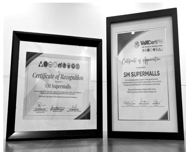
SM Supermalls awarded with Certificates of Recognition by the DILG, DOH, DTI, and DICT for their vaccination efforts

Publication: Cavite Times Journal Dates: March 15, 22, 29 & 2022