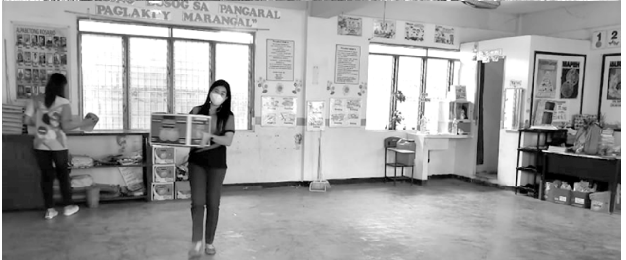
Ang mga guro sa TEJEROS CONVENTION ELEMENTARY SCHOOL HABANG ABALA SA PAGLILINIS AT PAGAAYOS NG MGA GAGAMITNG ROOM PRA SA F2F CLASS.

CAVITE TIMES JOURNAL PAHAYAGAN NG TUNAY NA CAVITEÑO