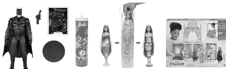
The Batman's back! Incredibly detailed 7" scale McFarlane DC Comics Multiverse Batman figure is designed with ultra-articulation as his posture and look in the upcoming The Batman movie. Available in select Toy Kingdom stores.

Rounding up the list are portable playsets from Frozen and Barbie; and