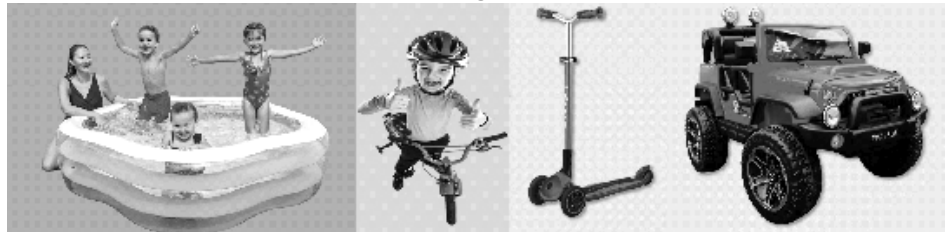
Enjoy a summer splash with the family with this Intex Summer Color Pool.

Explore the great outdoors and say Hooray for Summer fun with amazing play-mates from Toy Kingdom. Here are Toy Kingdom's 10 Top Toys that will make this summer exciting and memorable.