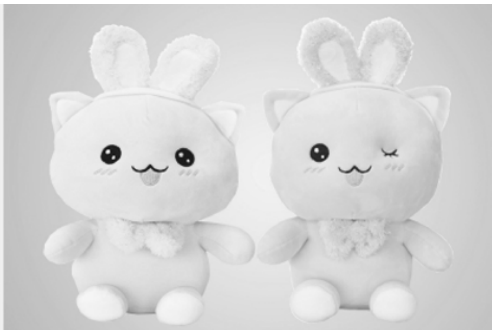
To hug and to hold. Fluffy Kawaii Bunnies from Toy Kingdom.

The SM Store's Kids' Accessories section is a great Easter bunny stop. There are fun and functional plush Bunny Headphones, Bunny Arm Pillows, Bunny Plush Round pillows, Plush Cuddle Buddies Rabbit pillows, and Bunny fans.