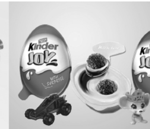
Hop in for a sweet and Easter surprise toy with Kinder Joy.