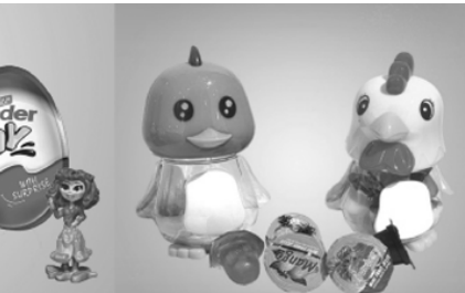
Easter Chick Candy Jar from SM Snack Exchange.

and celebrate the Eggs-traordinary Easter Fun with the SM Store, SM Snack Exchange and Toy Kingdom. Visit