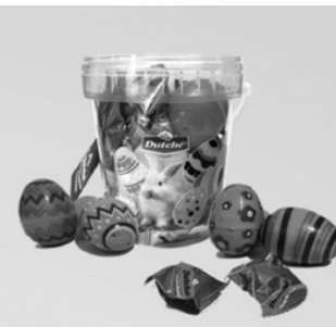
Tuck a bouquet of these Swirl Pops to your Easter basket.