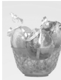
Colorful swirl egg-shaped hard candies add a new twist for your egg hunting experience.