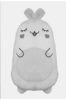
Adorable 60cm Plush Cuddle Rabbit buddy from AXCS at Kid's Accessories Department at The SM Store.