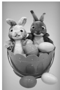
There's a lot of egg-citement in Easter Egg Hunting with these colorful eggs, basket and a Peter Rabbit plush. Items are sold separately at Toy Kingdom