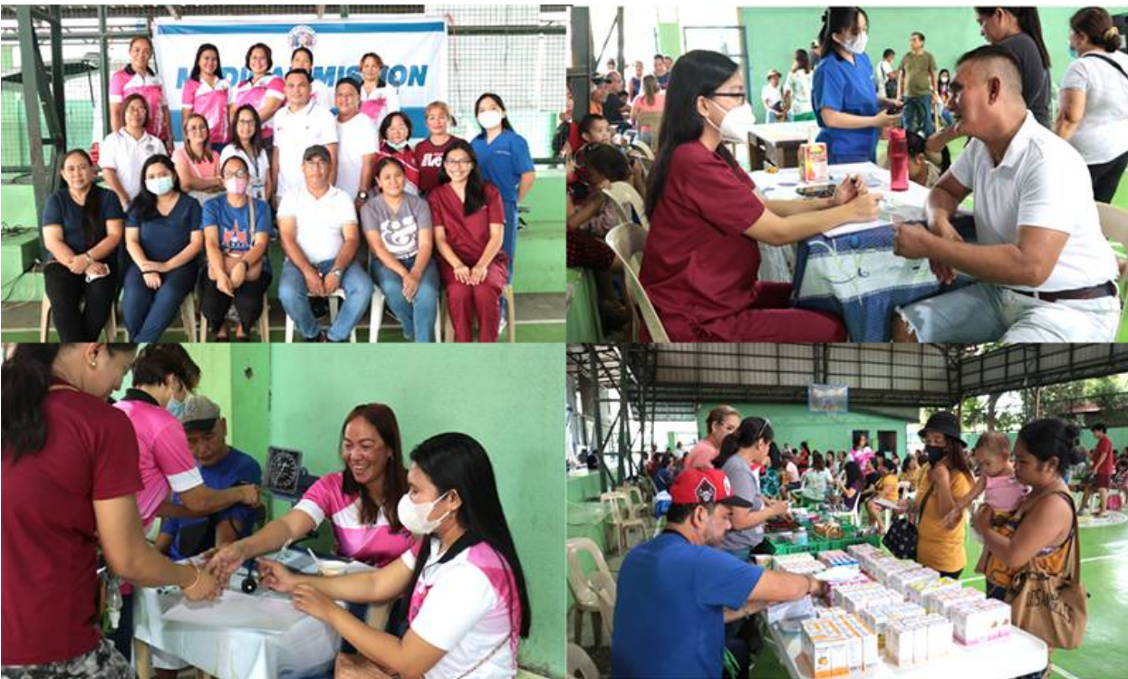
Bringing healthcare to the heart of Barangay Anabu II-C, Imus, Cavite! On December 21, 2023, the Office of the Provincial Governor's Medical Mission Team in partnership with the Office of the Provincial Health Officer conducted a compassionate health outreach activity in Brgy. Anabu II-C in the City of Imus, providing 260 residents with free medical check-ups, consultations, and essential medicines. The program is a testament to the Provincial Government of Cavite's commitment to community health and well-being.