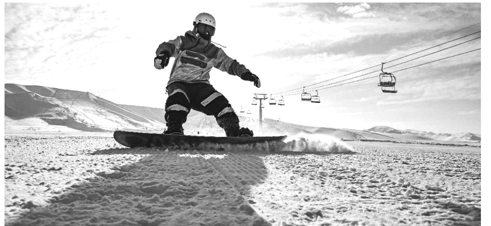
A tourist skis at a ski resort in Changji Hui autonomous prefecture, northwest China's Xinjiang Uygur autonomous region, Dec. 20, 2023.

and more local specialty products in Xinjiang have found a market. For instance, a cultural and creative park in Shuixigou township, Urumqi county, has built "bubble houses" that come with heating facilities, so that tourists can get a view of the beautiful sceneries outside these transparent "bubbles" in winter. The park also provides free