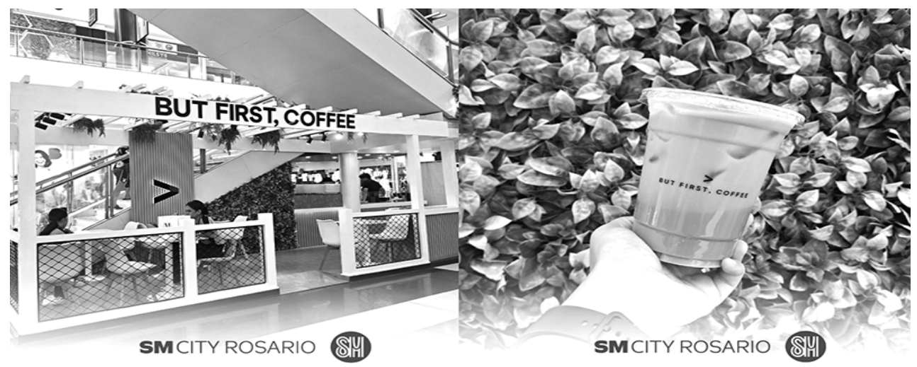
BUT FIRST, COFFEE IS NOW OPEN AT SM CITY ROSARIO: Looking for an instagrammable cafe that offers high quality, great-tasting, and affordable coffee? But First, Coffee is now brewing and ready to serve you at SM City Rosario, located at the first level in front of Watson's. Get your cup of coffee now!