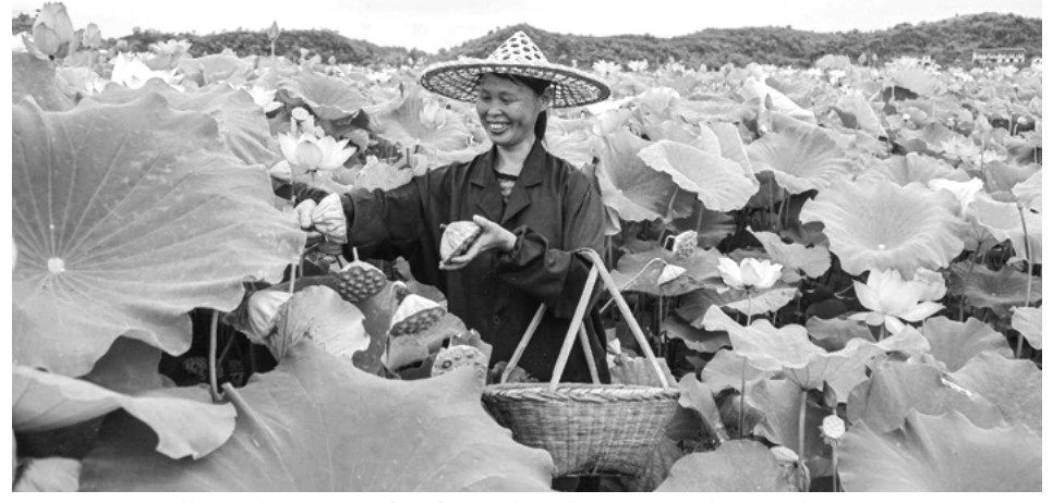
A woman collects lotus seedpods in Ganzhu town, Guangchang county, east China's Jiangxi province.

In the early spring dawn, the white lotus distribution center in Guangchang county, east China's Jiangxi province, is already bustling with activity, with buyers and sellers bargaining among mounds of white lotus seeds.