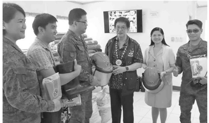
DoH-CALABARZON Regional Director together with staff from the communicable disease control cluster presents a set of personal protective equipment for used in anti-dengue elimination activities to Camp Capinpin military officers during the "Turn-Over of Anti-Dengue Supplies" held in Tanay Rizal on July 2, 2019