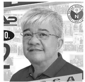
Mayor Yuri Alarca Pacumio

—oOo— Sa mga naghahanap po ng lupa na pagtatayuan ng bahay, meron pong magandang location na binebenta sa loob ng Rio De Oro Subd. Ito po ay negotiable, pwedeng installment ang pagbabayad. Ito ay 233sqm. Sa mga interesado mag btx o tumawag sa cp# 0995-608-6978, 0942-460-1520 para sa mga karagdagang detalye.