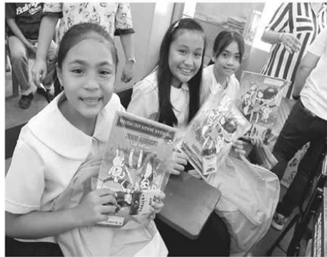
These girls happily show their brand new school supplies courtesy of The SM Store's #SMShareMovement Donate-a-Book campaign.