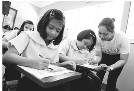
Children from Balanga Elementary School enjoyed a fun coloring activity as part of the story book reading session.