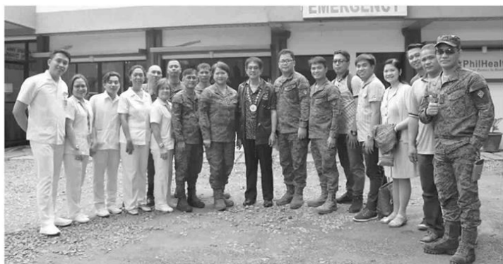
DOH-CALABARZON staff and Cam Capinpin officers and medical staff poses for a pictorial after the turn-over ceremony held in Tanay, Rizal on July 2, 2019.