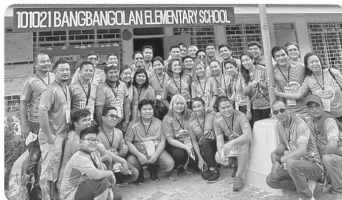
Bayer employees cooked, packed and distributed 500 food packs to elementary school children in San Fernando, La Union

Bayer Fund in partnership with Gawad Kalinga (GK) distributed 500 food packs to elementary school children in four public schools in San Fernando, La Union recently.