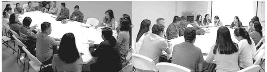
Isinagawa noong June 25, 2019 sa PhilHealth Regional Office IVA ang Round Table Discussion na dinaluhan ng limang pasilidad mula sa mga bayan ng Quezon.

katulong ang mga Health Care Institution, ang serbisyo sa miyembro nito nasa ilalim ng National Health Insurance Program (NHIP). (JPC)