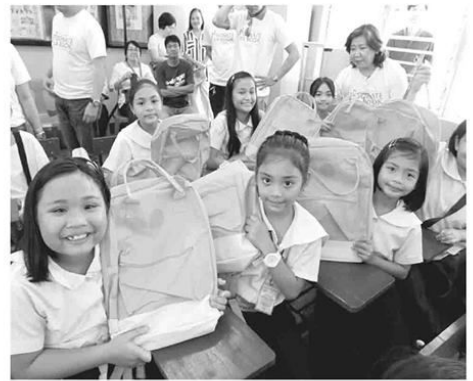
Kids from Balanga Elementary School are ready for back to school with their new back packs from The SM Store .