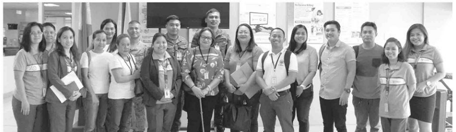
Isa lang ang Round Table Discussion na paraan upang mas mapabuti ang ugnayan ng PhilHealth at mga Health Care Provider