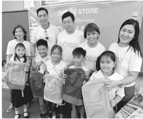
Grade three pupils of Balanga Elementary school received brand new back packs with school supplies from The SM Store .

The SM Store Share Movement Donate-a-Book campaign is ongoing until July 7 in all The SM Store branches nationwide. Shoppers can share new and pre-loved gently used books. The SM Store also accepts school packs and text books. (Michelle V. Cataulin PRO)