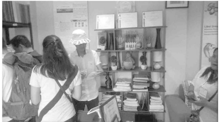
Photo shown The ATI Complex Region IV - A together with the participants gathering some information materials on organic farming and other useful tips on planting of different fruits and vegetables for free.

The program proceeded to lunch break and the tour on ATI Region IV - A complex, were all