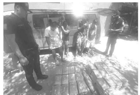
Nasa larawan ang mga nasakoteng suspek at ang bulto bultong marijuana.