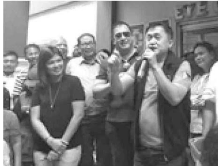
Sen. Bong Go nagbigay ng mensahe sa mga nasunugan kasama si Bacoor City Mayor Lani Mercado.

iparating sa kanya ang inyong mga karangian, at darating po ang tulong."