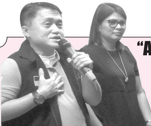
Sa larawan makikita sina Bacoar City Mayor Lani Mercado Revilla at Senator Bong Go na nagbibigay ng mensahe sa mga nabiktima ng sunog na nasa evacuation center sa Brgy. Talaba 7, Lungsod ng Bacoar nitong July 8, 2019.

VOL. XV • NO. 21 • 10.00 • JULY 09 - 15, 2019