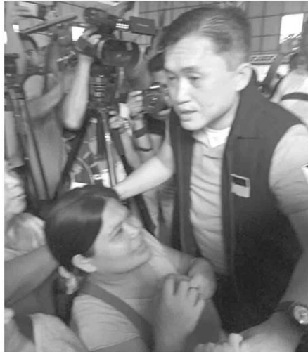
ANG pangangamusta ni Senator Bong Go sa mga nabiktima ng sunog. Ang unang tanong niya, "ok ba kayo? may nasaktan ba sa inyo?", pagmamalasakit ng Senator.

mga sakit sa puso o sa kidney na maipagamot. Ilapit lamang sa kanya at siya na ang bahala sa pamasaha, sa operation hanggang sa makauwi sa Cavite.